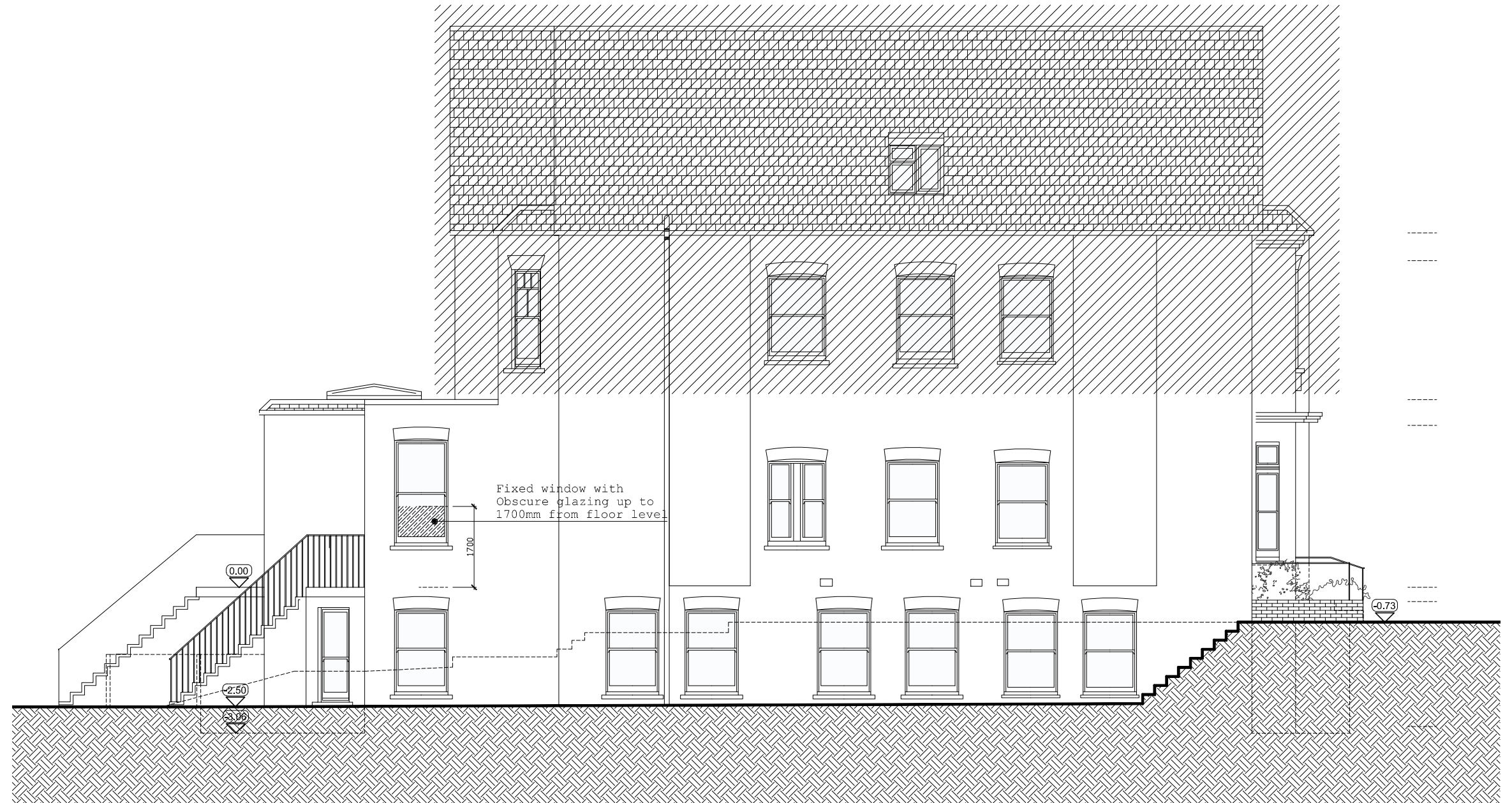
Proposed South (Side) Elevation Scale 1:100