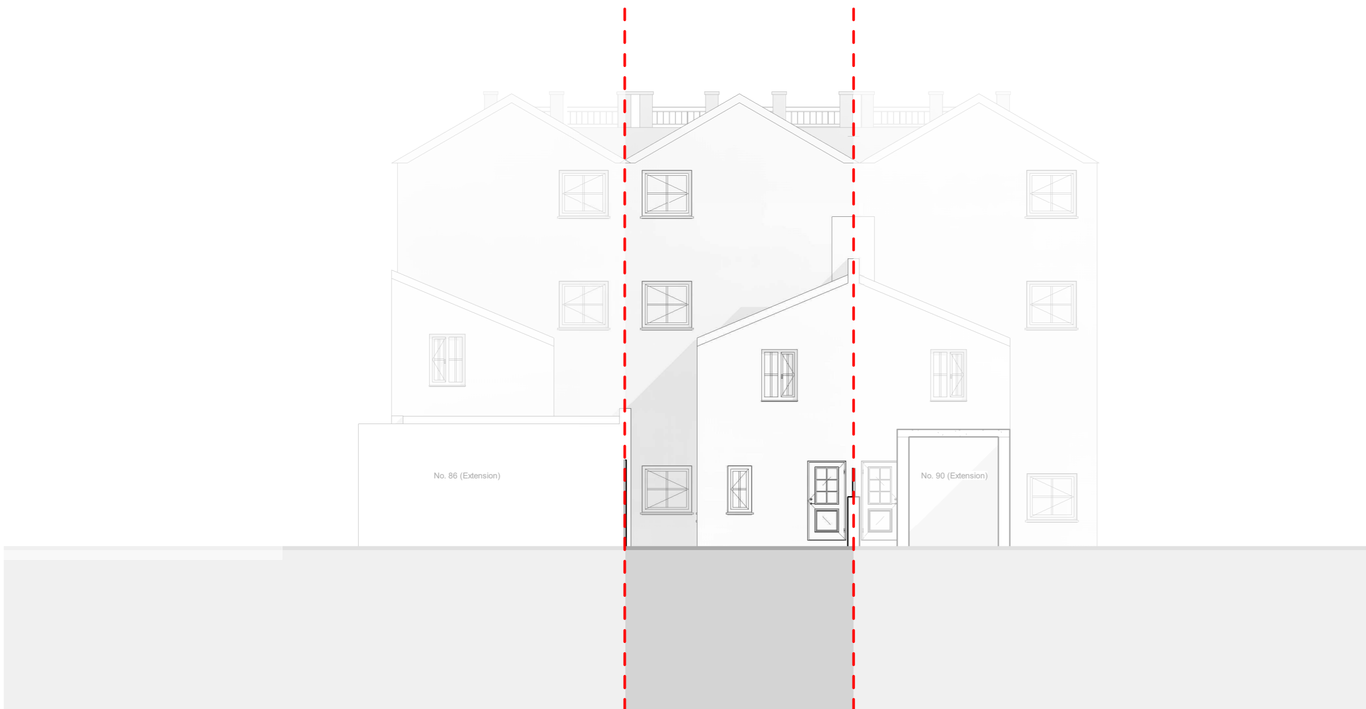
② Existing Rear Elevation 1 : 100