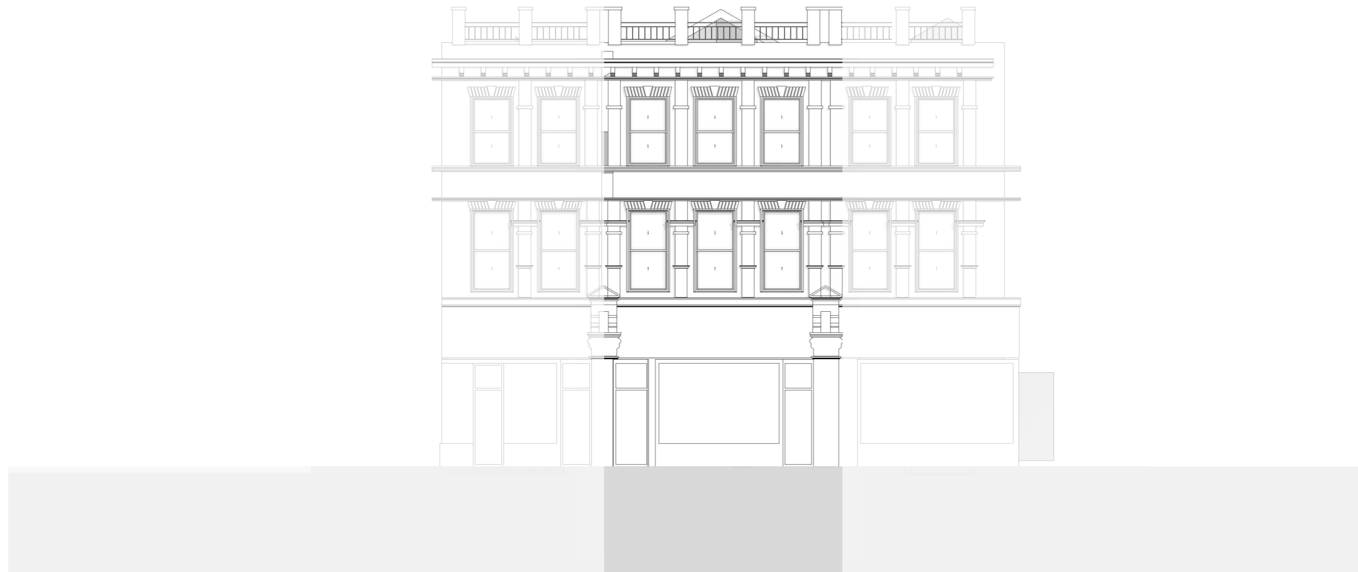
① Existing Front Elevation 1 : 100