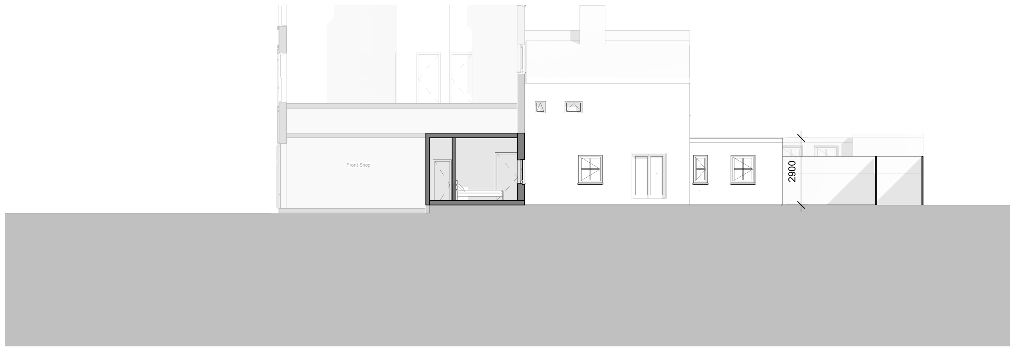
③ Proposed Section B-B 1 : 100