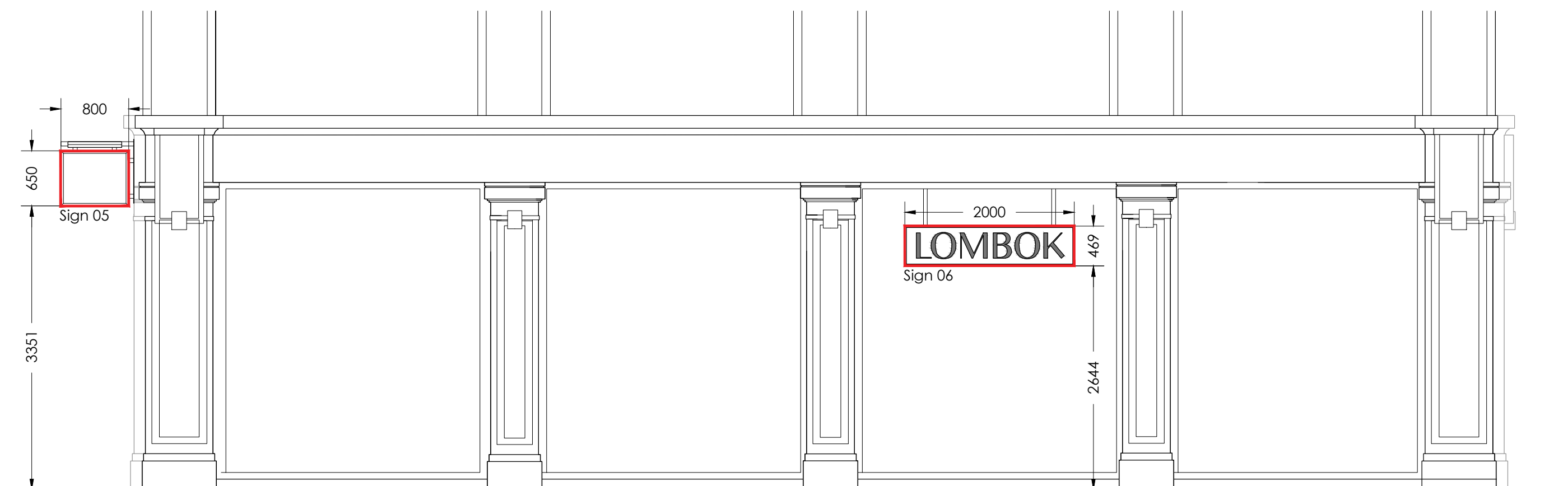
02 Existing Signs 05-06 Scale 1:50 (Chennies Street)