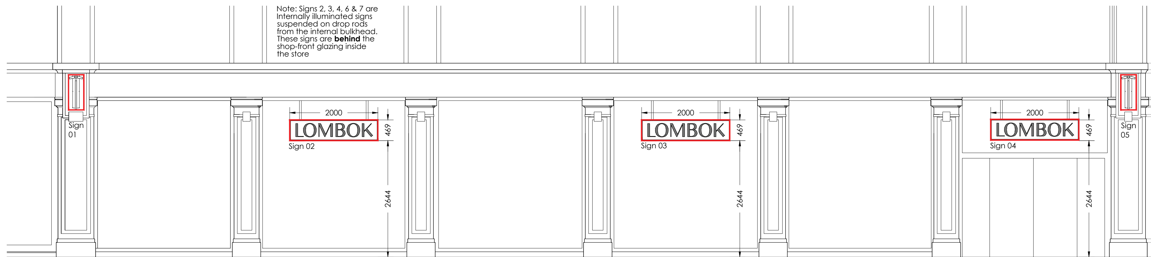
01 Existing Signs 01-02-03-04-05 Scale 1:50 (Tottenham Court Road)