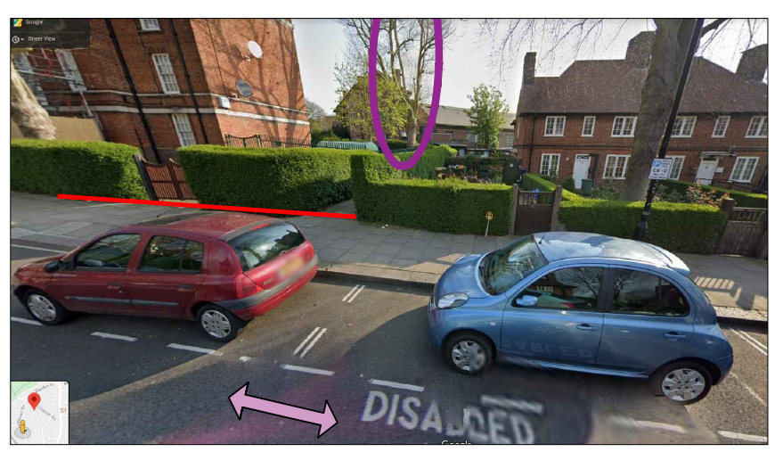
View to site from Croftdown Road - Protected Tree Circled

led Drawing D15 Image Views FARRANS CONSTRUCTION Camden Highgate Newton