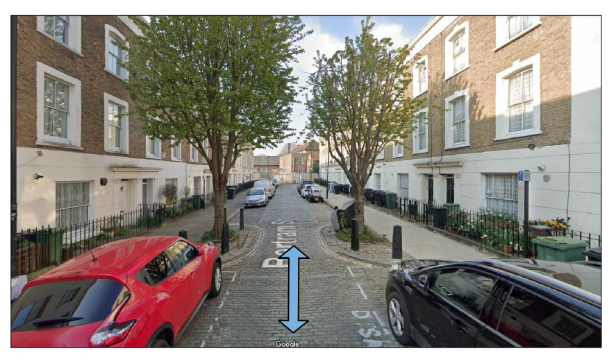
View from Bertram Street Looking to Site Entrance