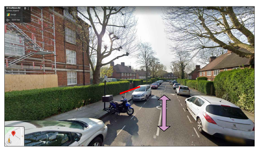
View on Croftdown Road (North to South)