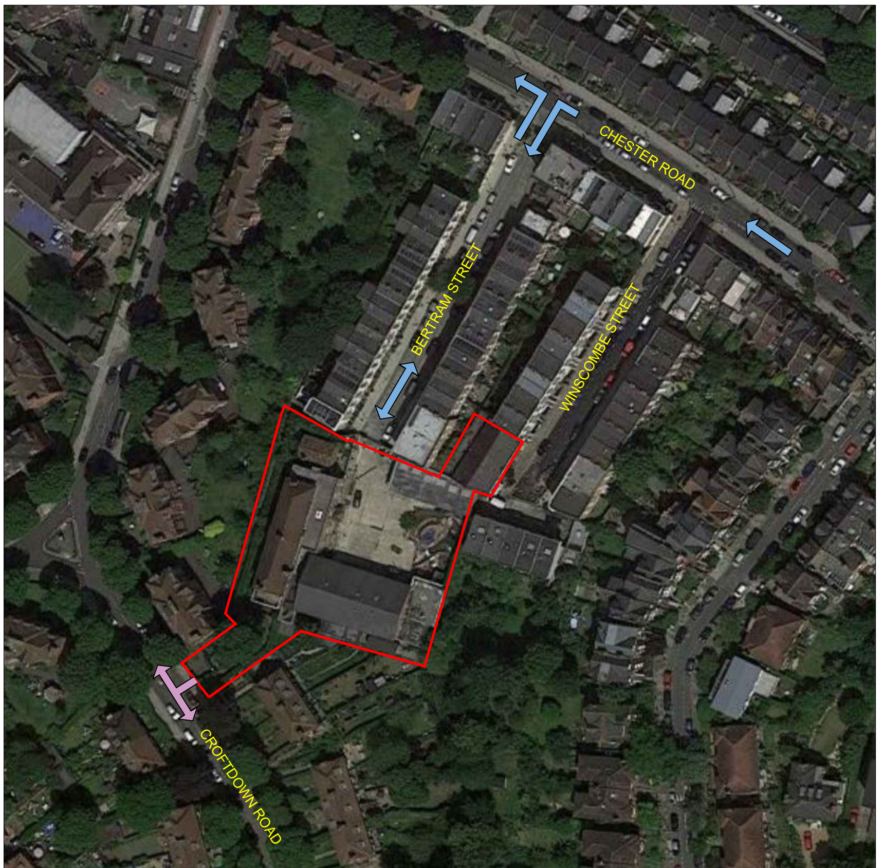
Ariel View showing Traffic Flow at Surrounding Streets from Site Location

Site Boundary Direction of Vehicle Movement (Superstructure and Substructure) Direction of Vehicle Movement (Substructure only)