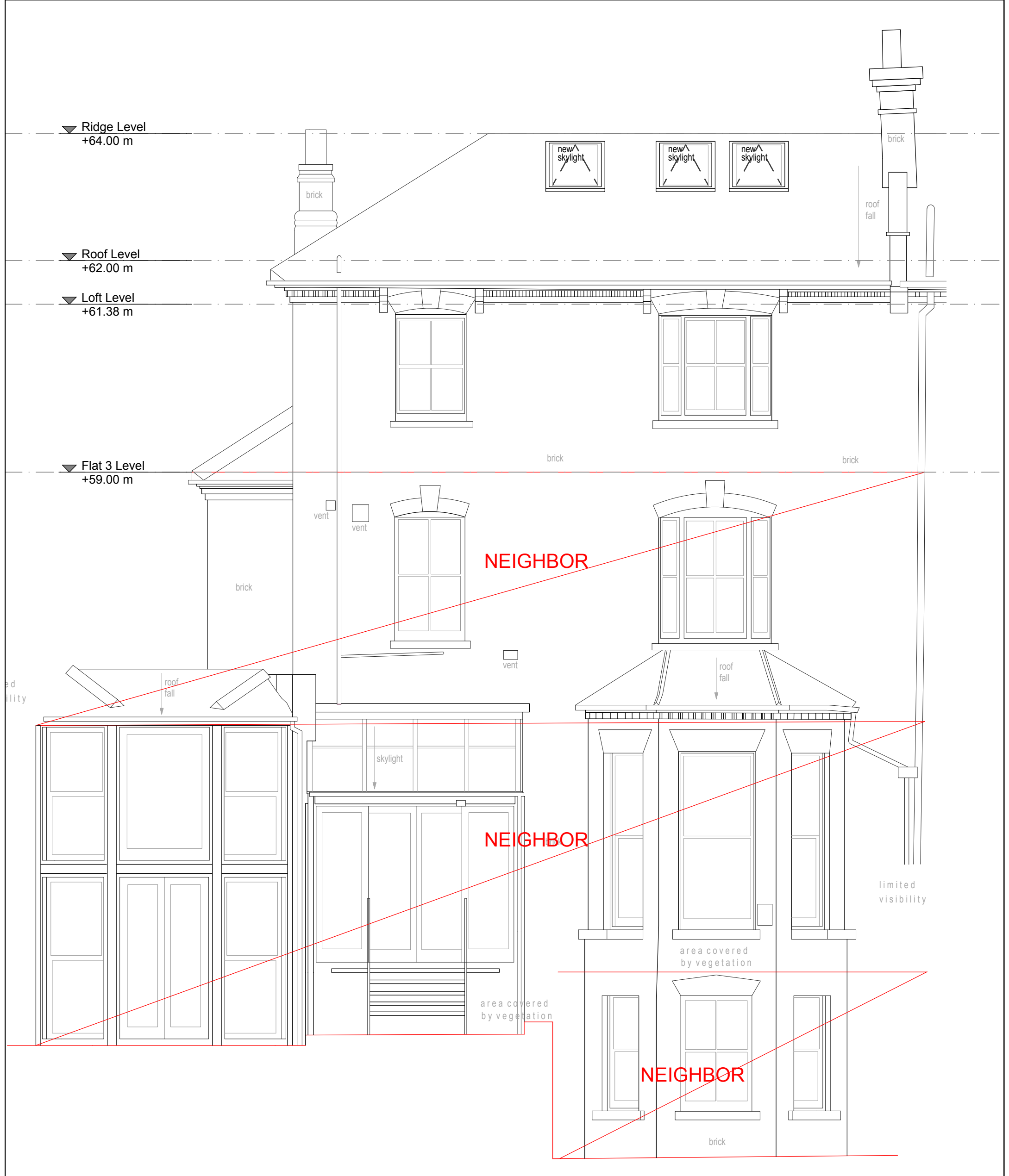
Proposed - Rear Elevation