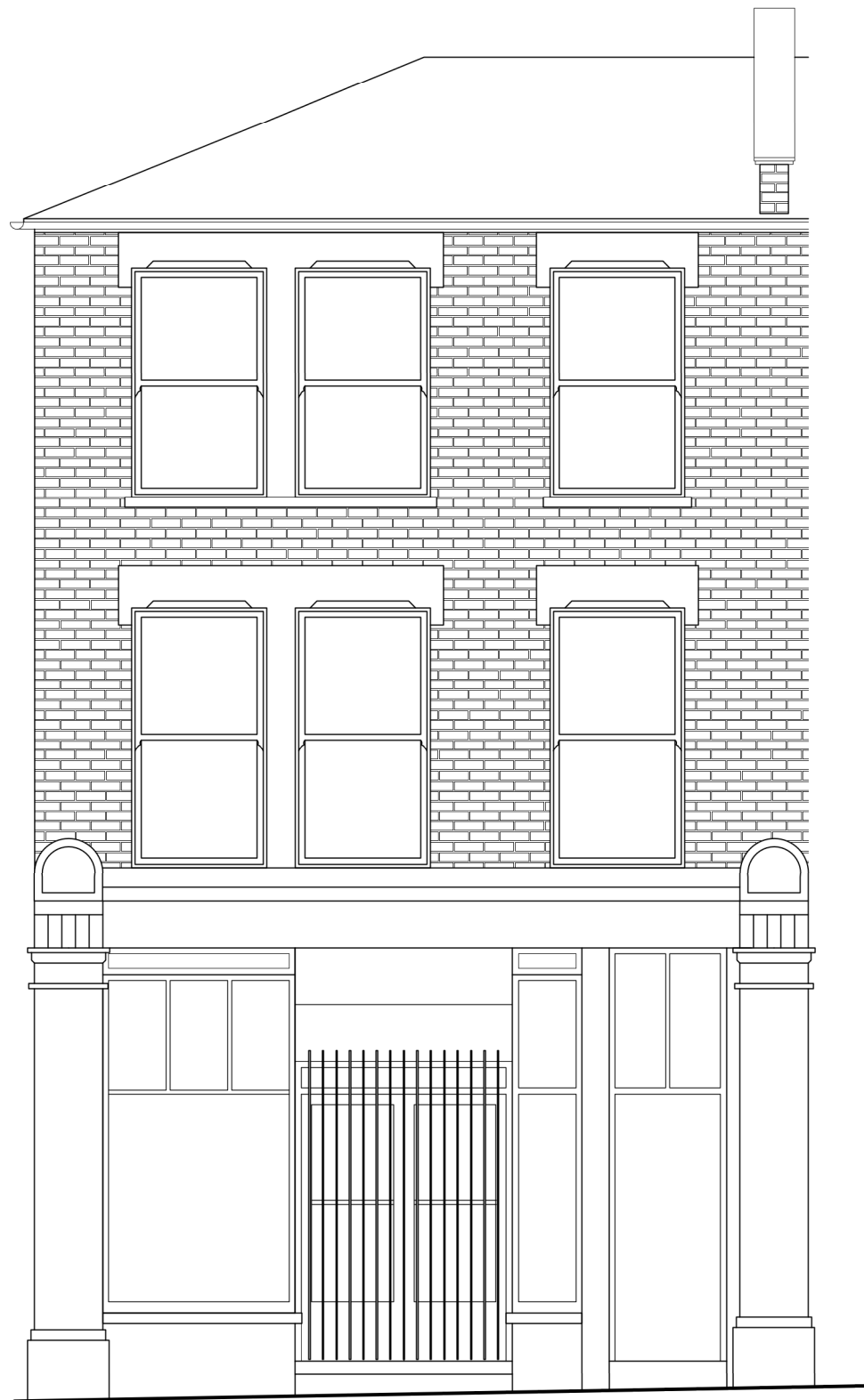
Front Elevation (Fortess Road)