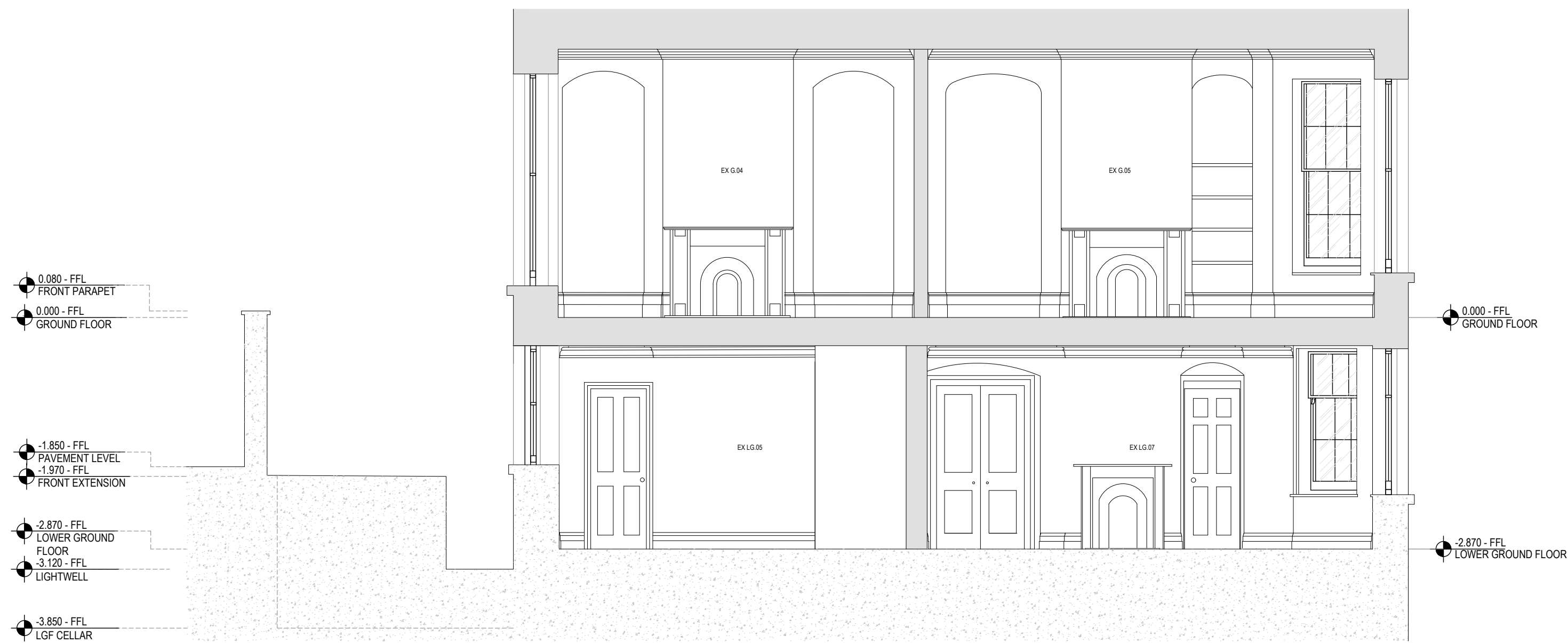
1 EXISTING - SECTION 04 SCALE: 1:50 @ A1 / 1:100 @ A3