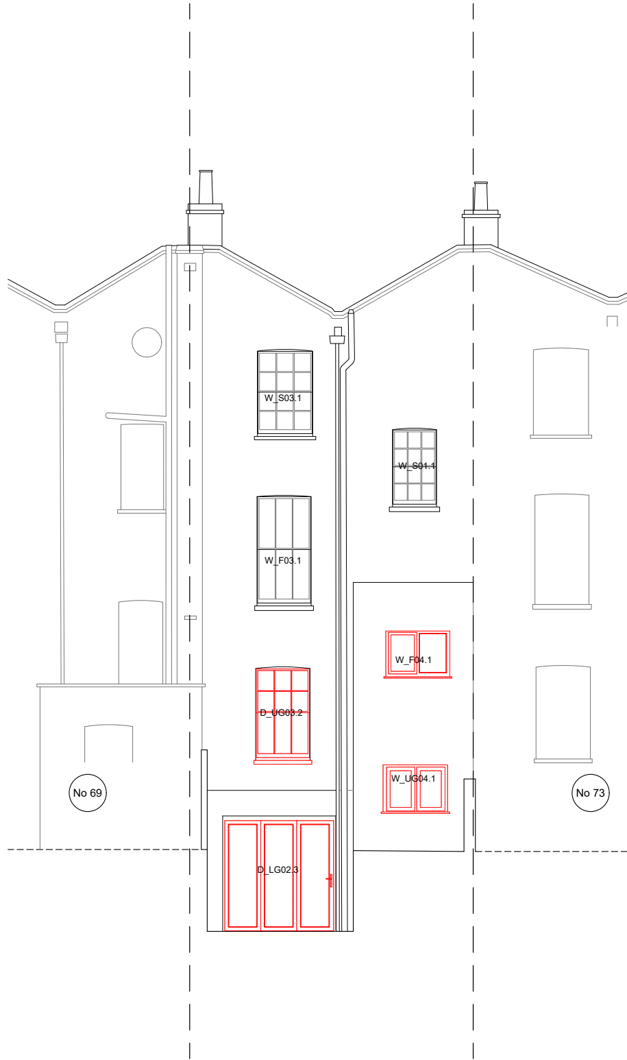
Demolition Rear Elevation Scale 1:50@A1 Scale 1:100@A3

NOTES 1. ALL DIMENSIONS AND LEVELS TO BE CHECKED ON SITE PRIOR TO SETTING OUT OR MANUFACTURE. ANY DISCREPANCIES BETWEEN SITE, DRAWING OR SPECIFICATION TO BE REPORTED TO THE ARCHITECT IMMEDIATELY. 2. THIS DRAWING IS THE COPYRIGHT OF THE OWNERS