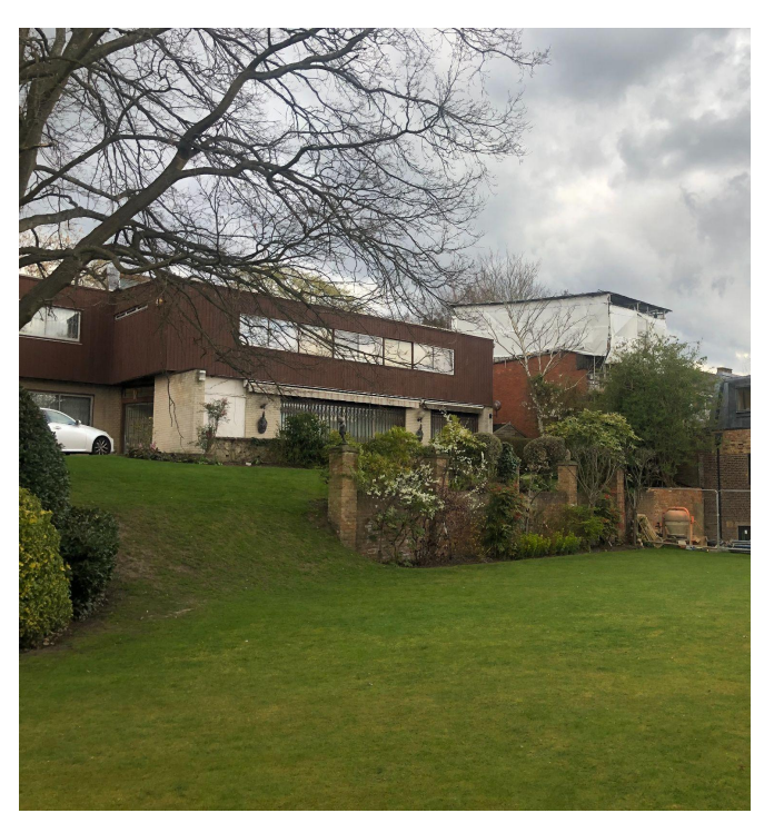
Pic 5: The scaffold and white sheeted part of the picture shows the area where the roof terrace would be on no.4 Oak Hill Park Mews. You can see how it would directly look into our garden allowing a pretty much 180 degree + view of it, getting rid of much of the privacy and increasing overlooking dramatically.

The Application includes a Noise Impact Assessment which assesses the impact of noise from the roof mounted plant, but we are further concerned by the potential increase in noise from the use of the roof terrace, especially during evenings and late nights. In Summer, this may mean us not being able to open our bedroom window due to noise issues, which is unreasonable. We are also concerned about a constant hum and noise from the heat pump which may disturb the peace that we currently enjoy as well as the unsightly view of the solar panels from our bedroom window which would be extremely close to them.