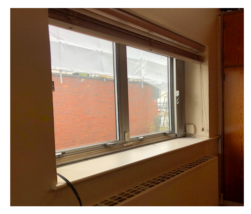
Picture 3 (left): shows the view of no.4 Oak Hill Park Mews from our bedroom window.