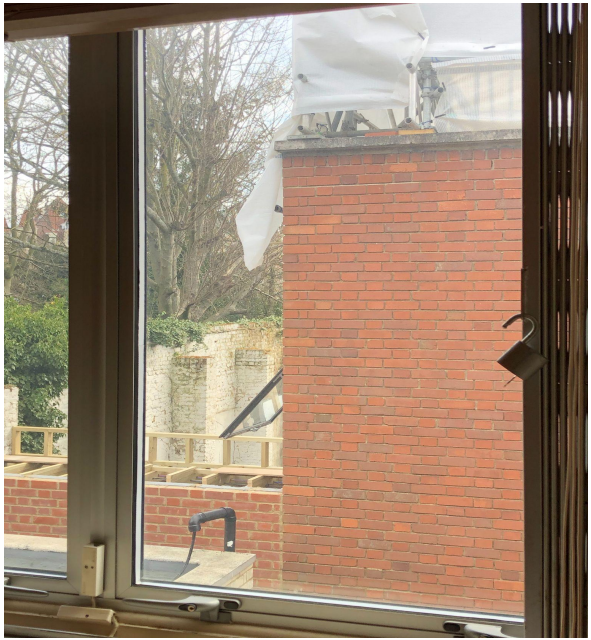
Pics 1 (L), 2 ®: Show No.4's Oak Hill Park Mews's roof from our bedroom window.