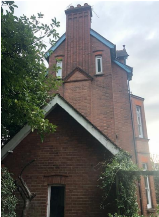
Side elevation of garage