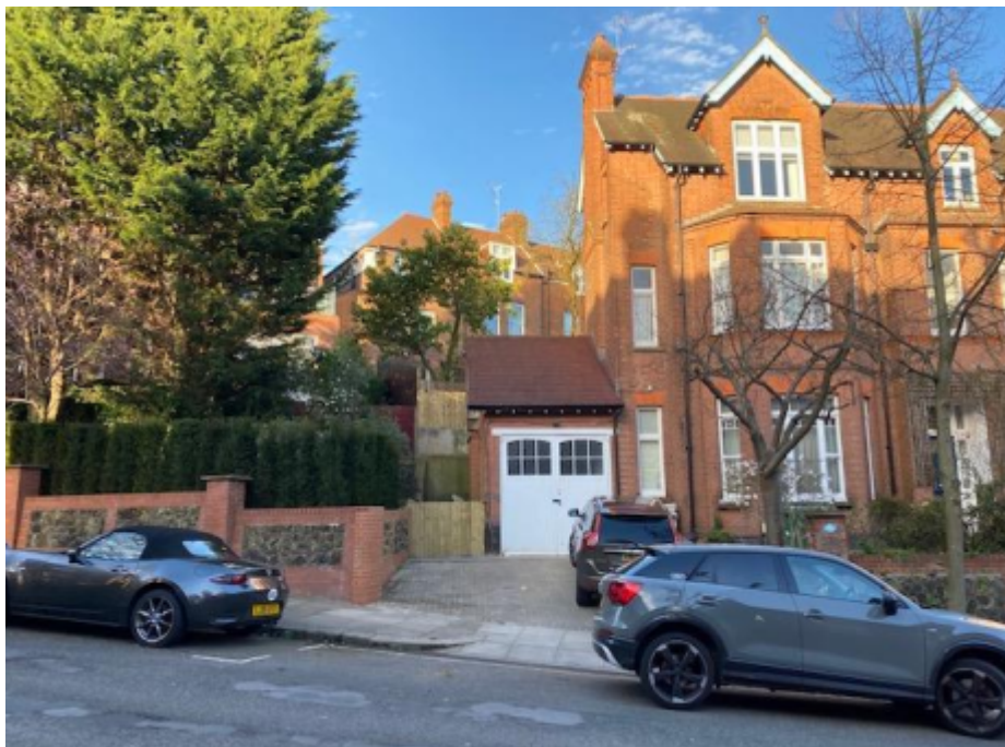
Front elevation and drive