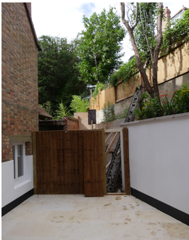
Existing rear view, showing rear boundary with properties on Redington Road where ground level is more than a storey higher than at the application site.