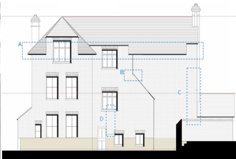
Photo 1 and Plan – Existing and proposed rear elevation (photo and annotated drawing from neighbours)