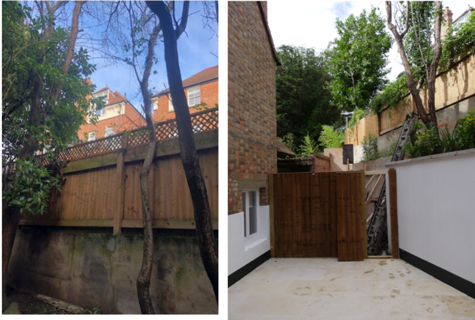
Existing rear view, showing properties to the rear are almost two storey higher in height