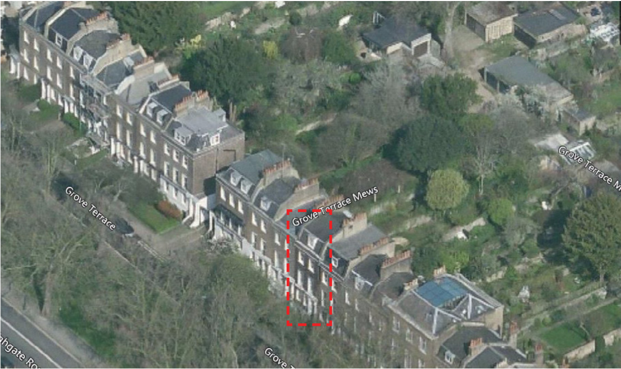
Aerial views of 18 Grove Terrace