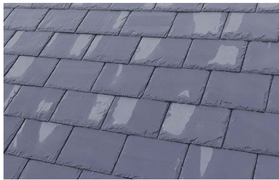
04 Proposed slate roof tiles (PL)700 Cwt y Bugail Dark Blue Grey Slate by Welsh Slate