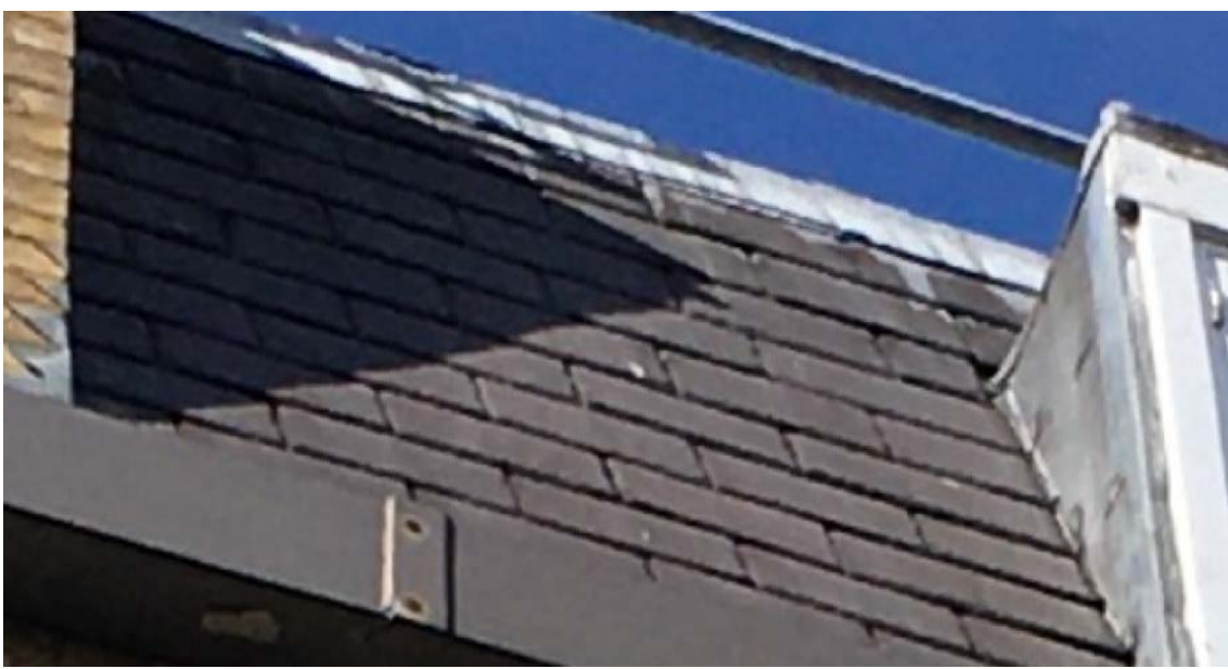
03 Existing slate roof tiles (PL)700