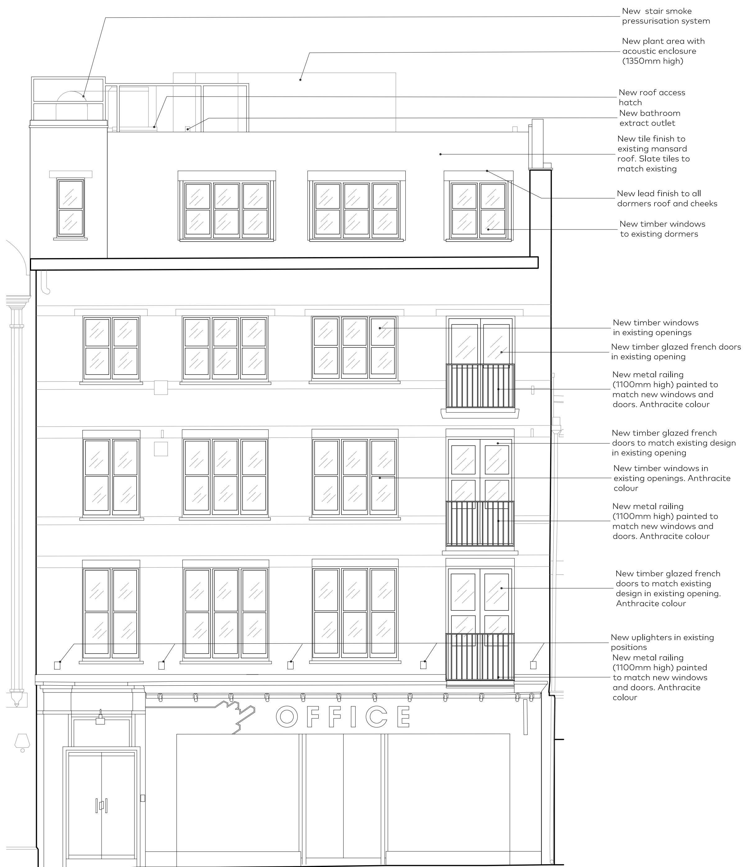
01 Front Elevation (PL)700 As Proposed