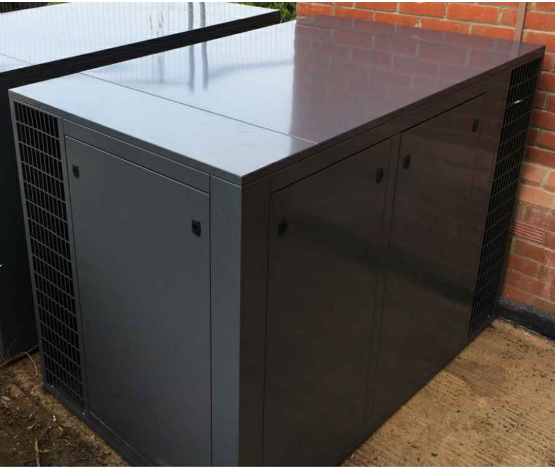
AIRCON UNIT WITH ACOUSTIC ENCLOSURE