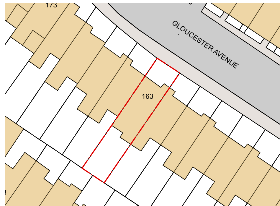
2 Block Plan Scale: 1:500