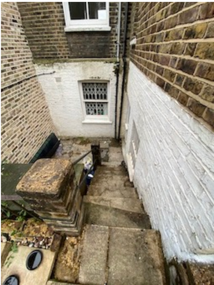
The existing rear well to nr.51a