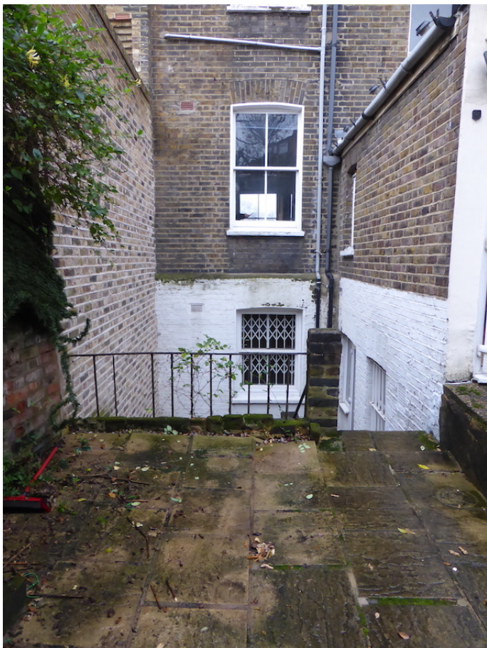
The space between nr.50 & nr.51