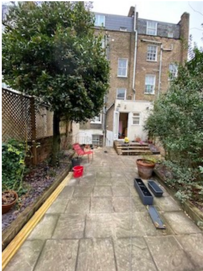
Rear elevation to nr.51