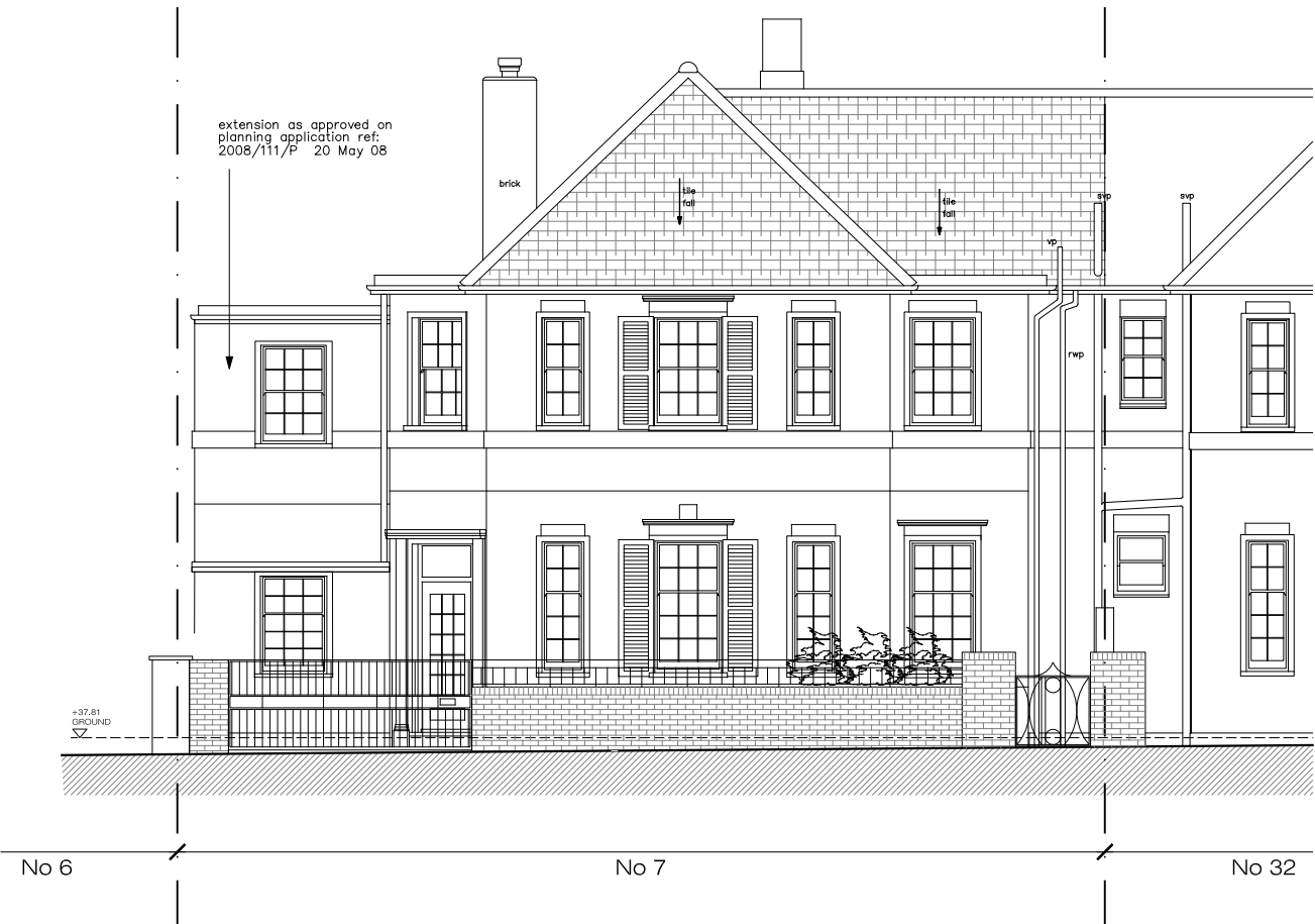
01 Front Elevation