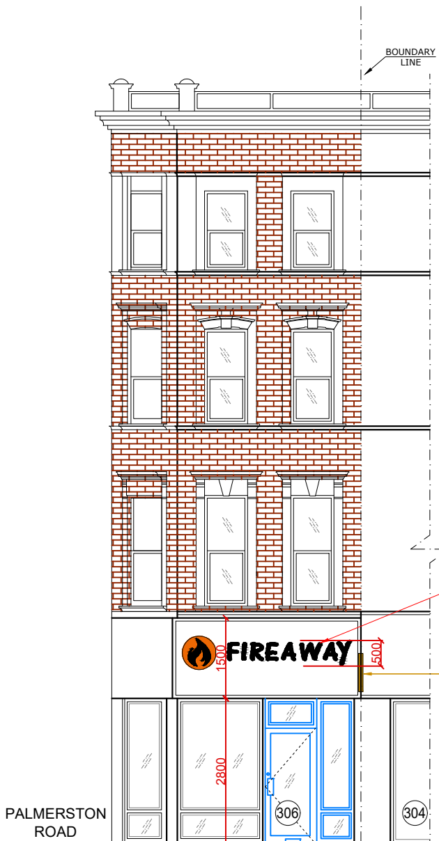
PROPOSED FRONT ELEVATION SCALE: 1/100 @A3