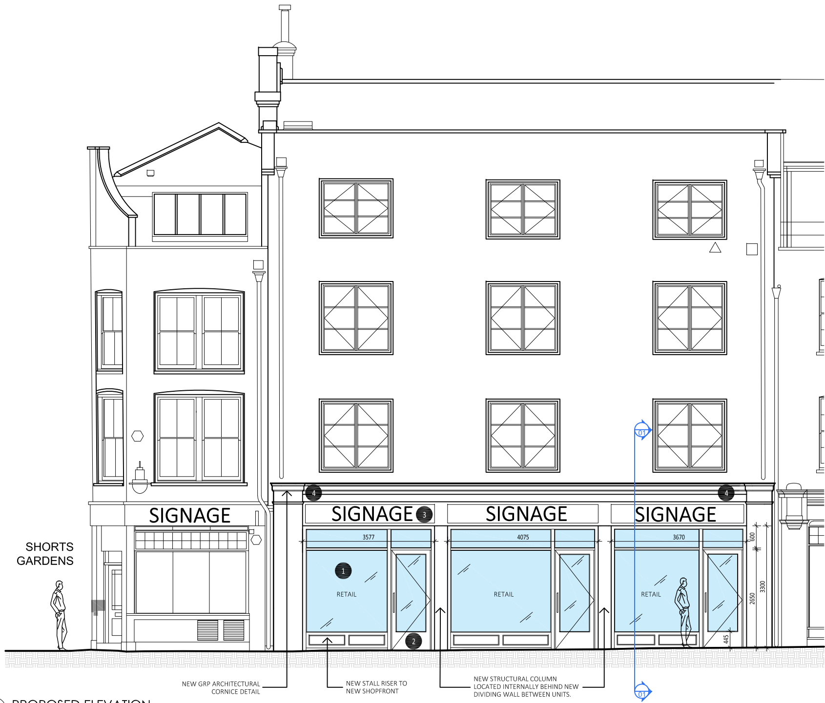
01 PROPOSED ELEVATION 1:100 @ A3