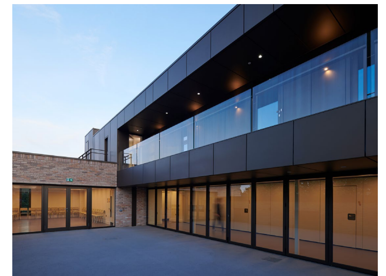
Second floor terrace today