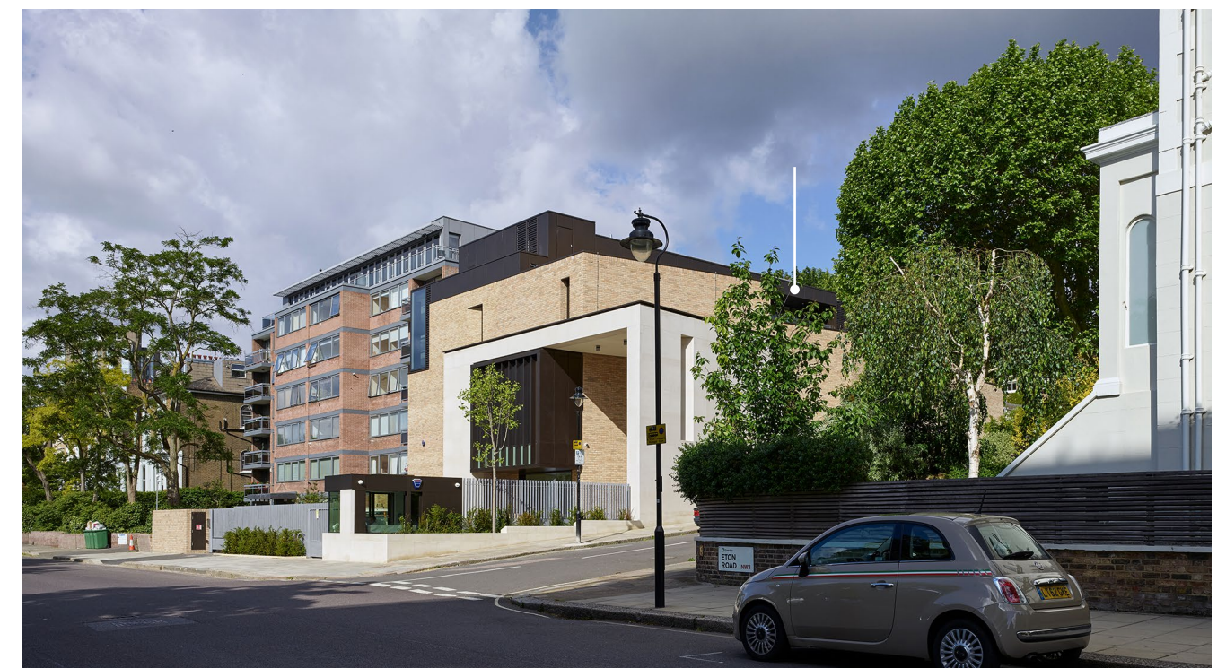
South Hampstead Synagogue looking west