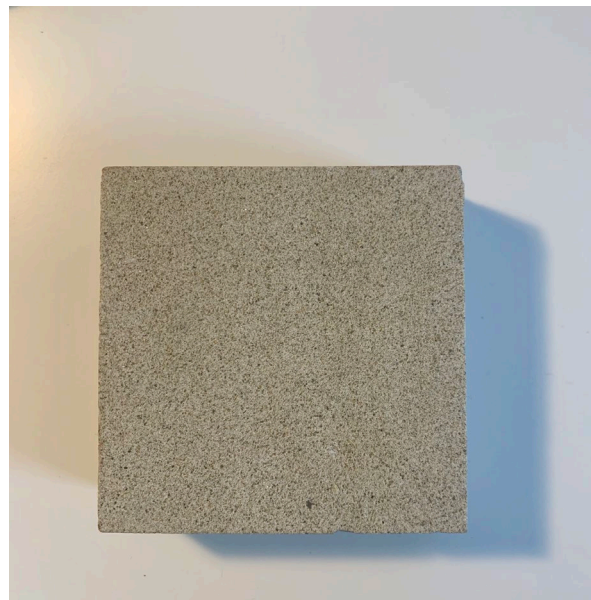
A.4 Proposed York stone (item 1) - Heathermoor Buff Yorkstone