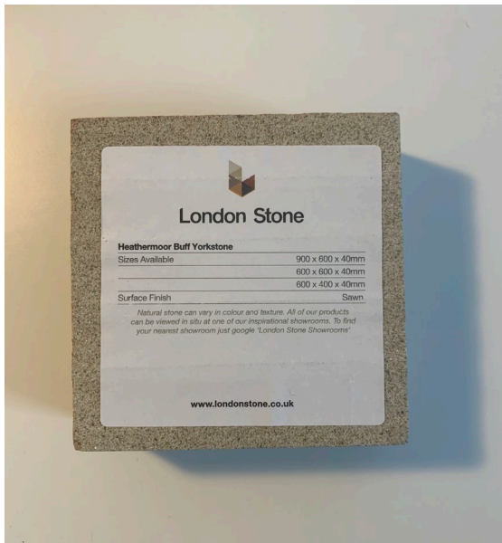
A.3 Proposed York stone (item 1) - Heathermoor Buff Yorkstone