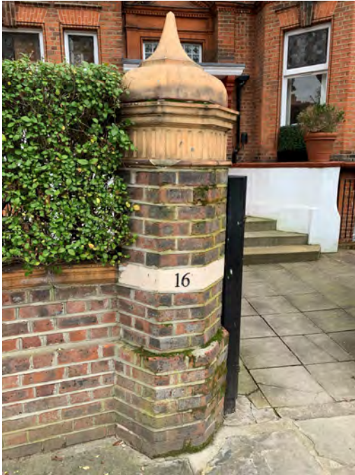
1. Existing pier at No 16 adjacent to 16a.