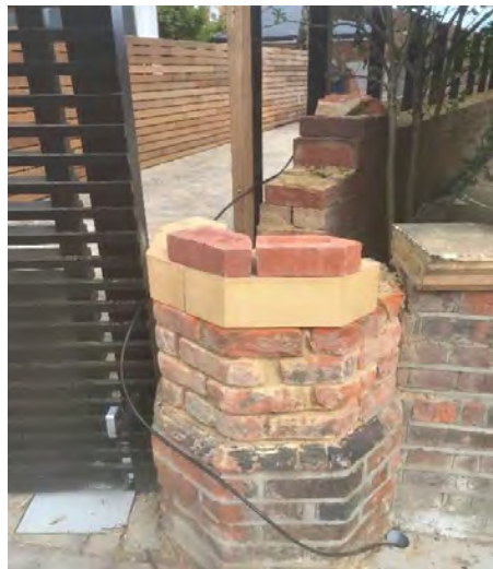
10. New terracotta & new brick in Position on No 18 pier .The new brick is a Saxon Red Multi.