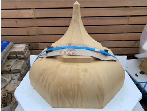
5. New capping piece, dimensioned exactly to dimensioned to the existing column cap.