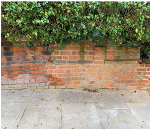
9. Existing low-level wall between No16a & No18