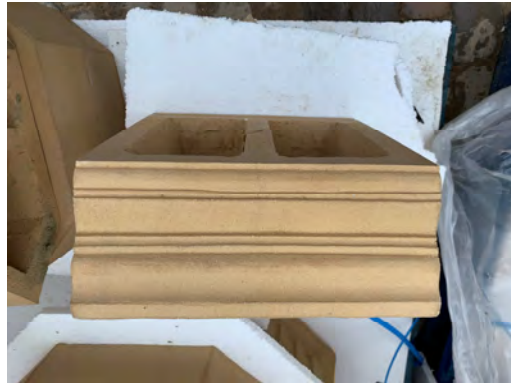
8. New wall capping piece.