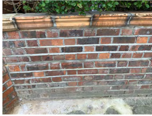
11. Pier adjacent to No18 showing replacement crease, terracotta band and replacement brick, Saxon Red Multi.

The above photographs show the intended replacement pier elements in comparison with the existing surrounding piers & wall at No16 & No18 Lyndhurst Gardens.