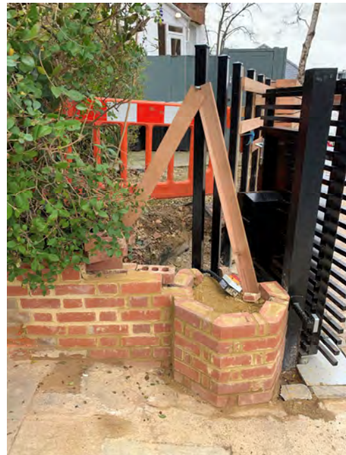
4. New pier in progress at No16a adjacent to No 18, before being cleaned.