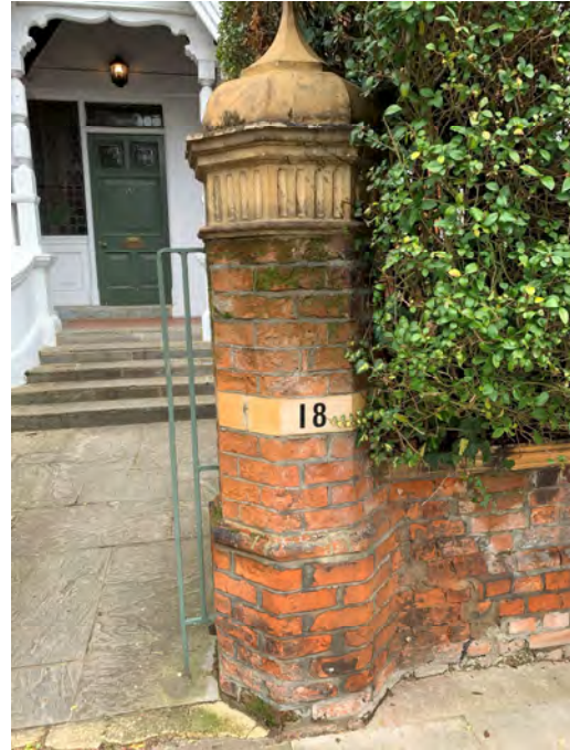
2. Existing pier at No 18 adjacent to 16a.