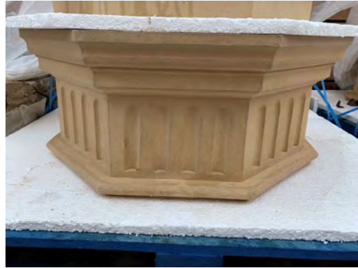
6. Intermediate capping piece, exactly to the existing column.