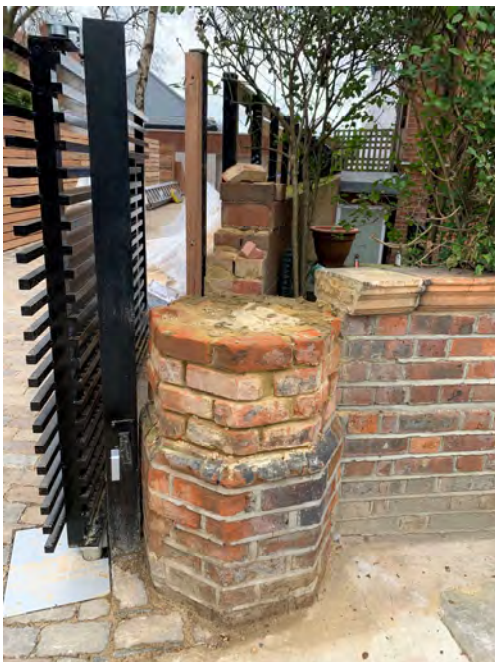
3. Existing pier at No16a adjacent to No 16.