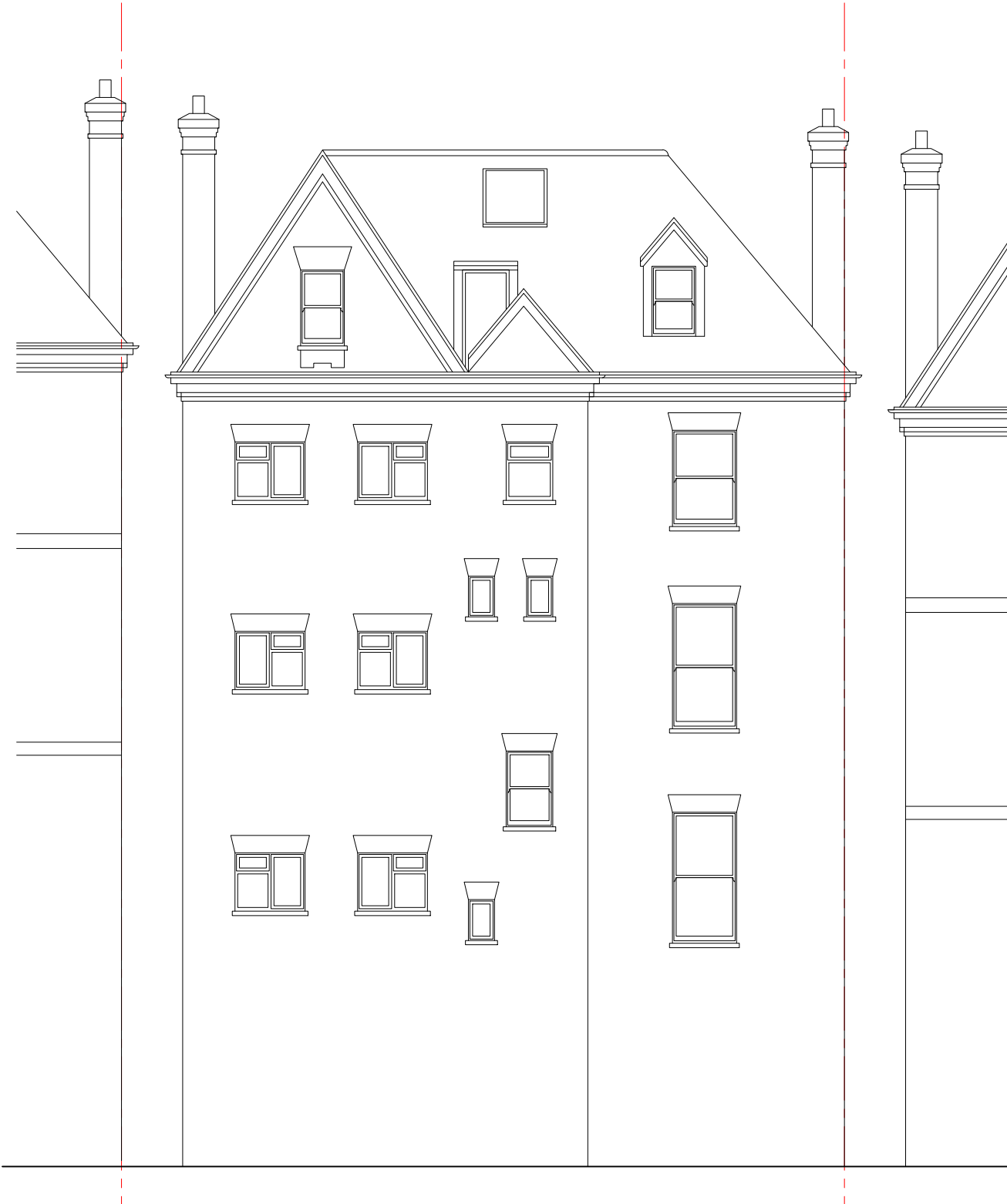
1 EXISTING REAR WEST ELEVATION 1 : 100

USE FIGURED DIMENSIONS ONLY. ALL DIMENSIONS MUJST BE CHECKED ON SITE & ANY INCONSISTENCIES MUST BE REPORTED BACK TO THE ARCHITECT. THIS DRAWING AND ANY DESIGNS INDICATED THEREON ARE THE COPYRIGHT OF THE ARCHITECT. ALL RIGHTS ARE RESERVED. NO PART OF THIS WORK MAY BE REPRODUCED WITHOUT PRIOR PERMISSION IN WRITING FROM THE ARCHITECT.