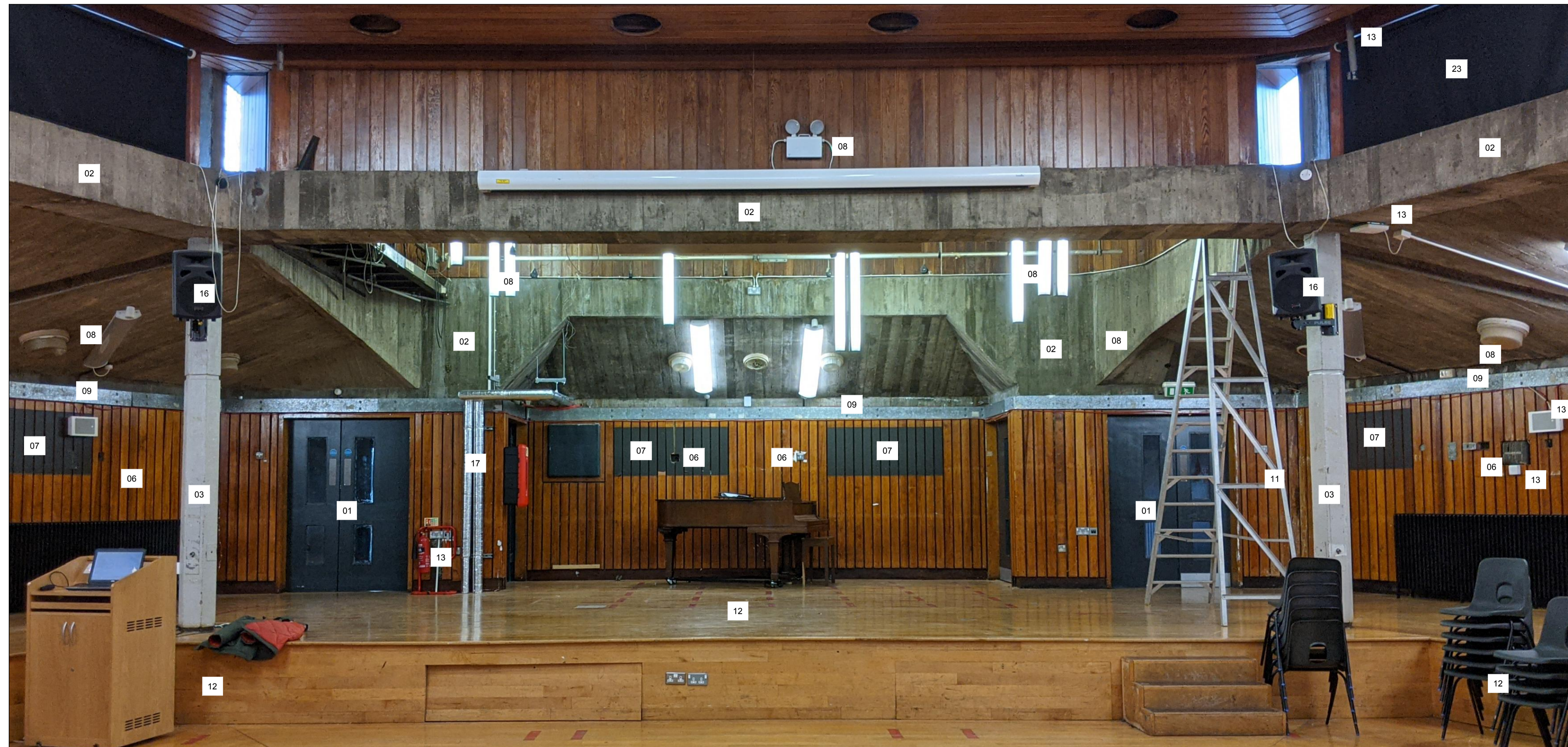
1. ELEVATION 04 - STAGE (NOT TO SCALE)