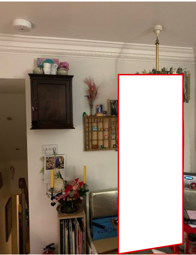
LOCATION FROM EXISTING KITCHEN ( '1' ON PLAN)