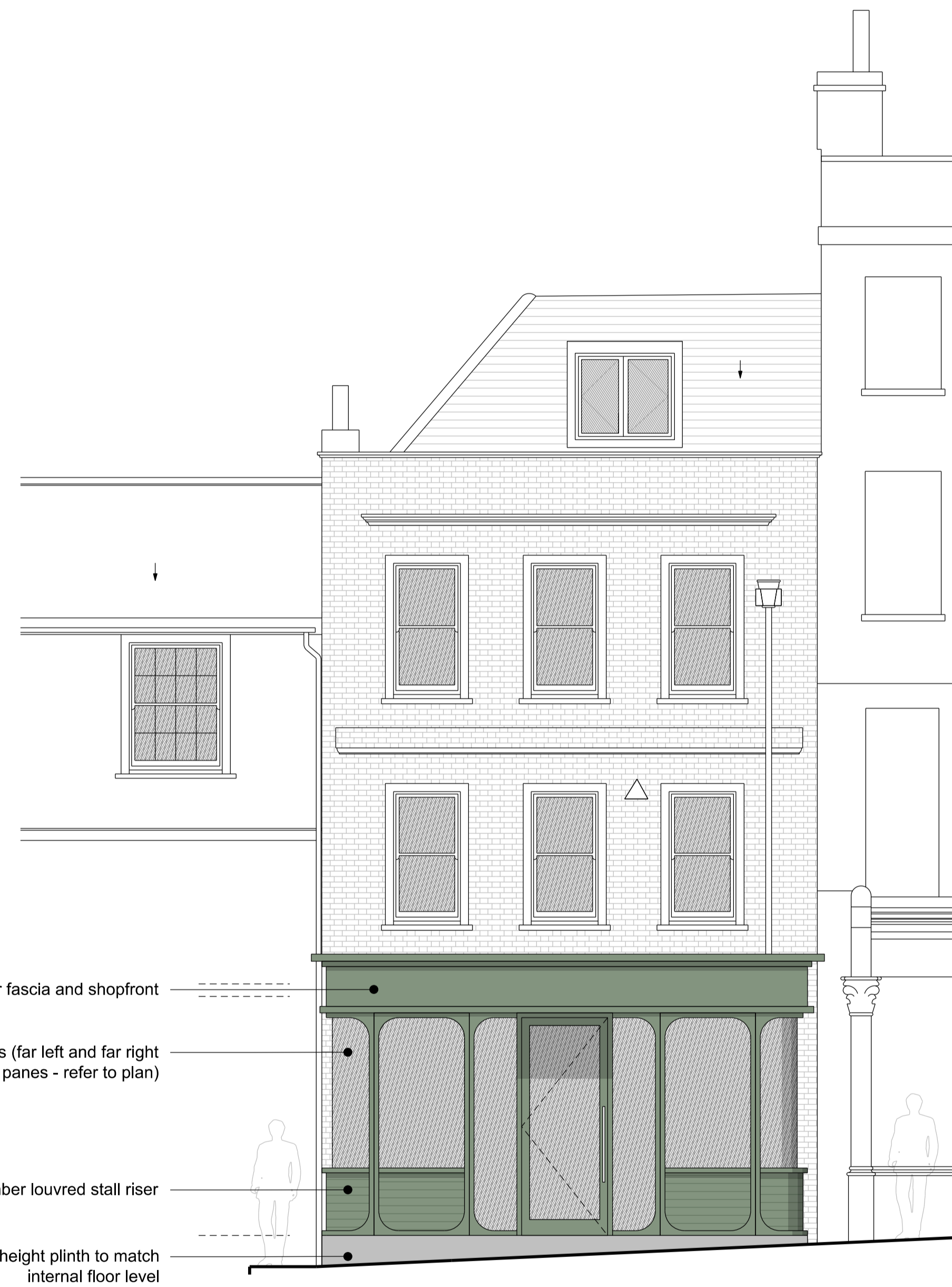
02 Proposed Elevation Scale 1:50 @A1 / 1:100 @A3

Perrins Court | 72 Hampstead High Street | 71 Hampstead High Street