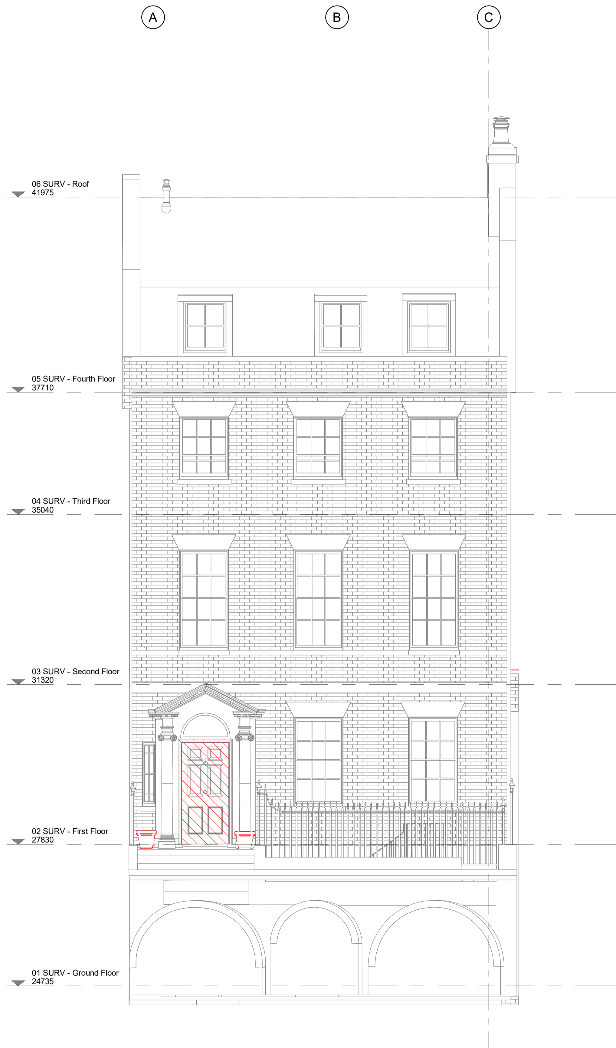
Demolition Front Elevation 1 : 50

THIS DRAWING IS TO BE READ IN CONJUNCTION WITH ALL RELEVANT ARCHITECTS, STRUCTURAL ENGINEERS, M&E ENGINEERS AND OTHER CONTRACT DOCUMENTS.