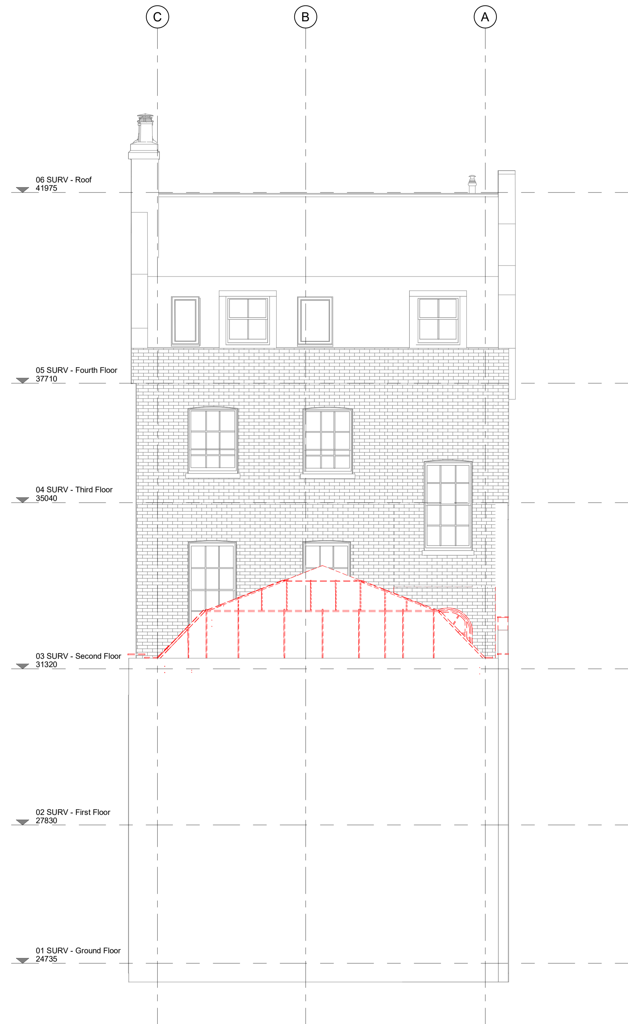
Demolition Back Elevation 1 : 50