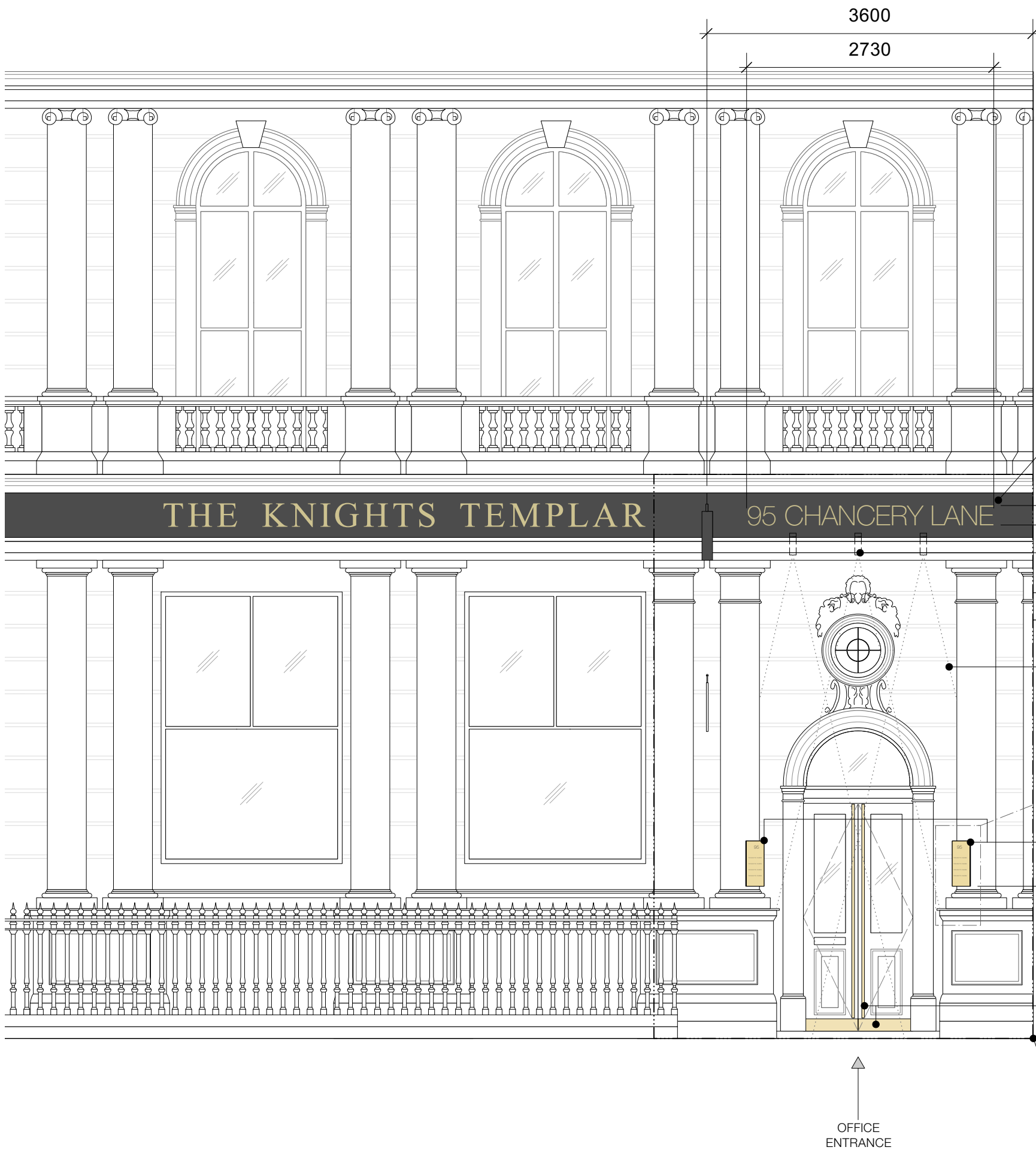
DETAIL A | Scale 1:20