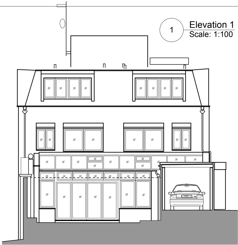
1 Elevation 1 Scale: 1:100