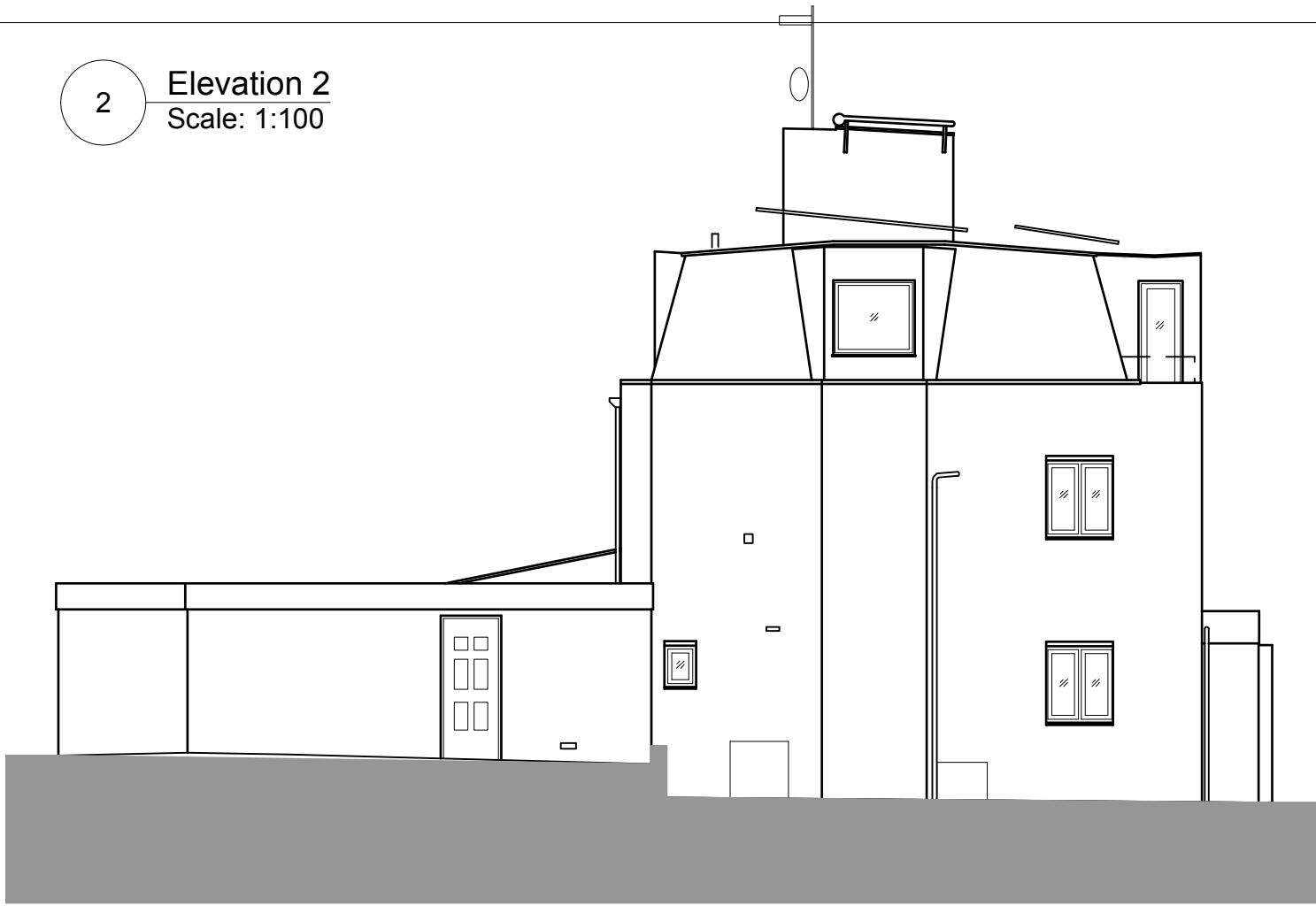
2 Elevation 2 Scale: 1:100