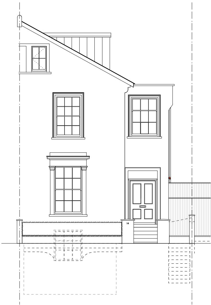
Front / Street Elevation