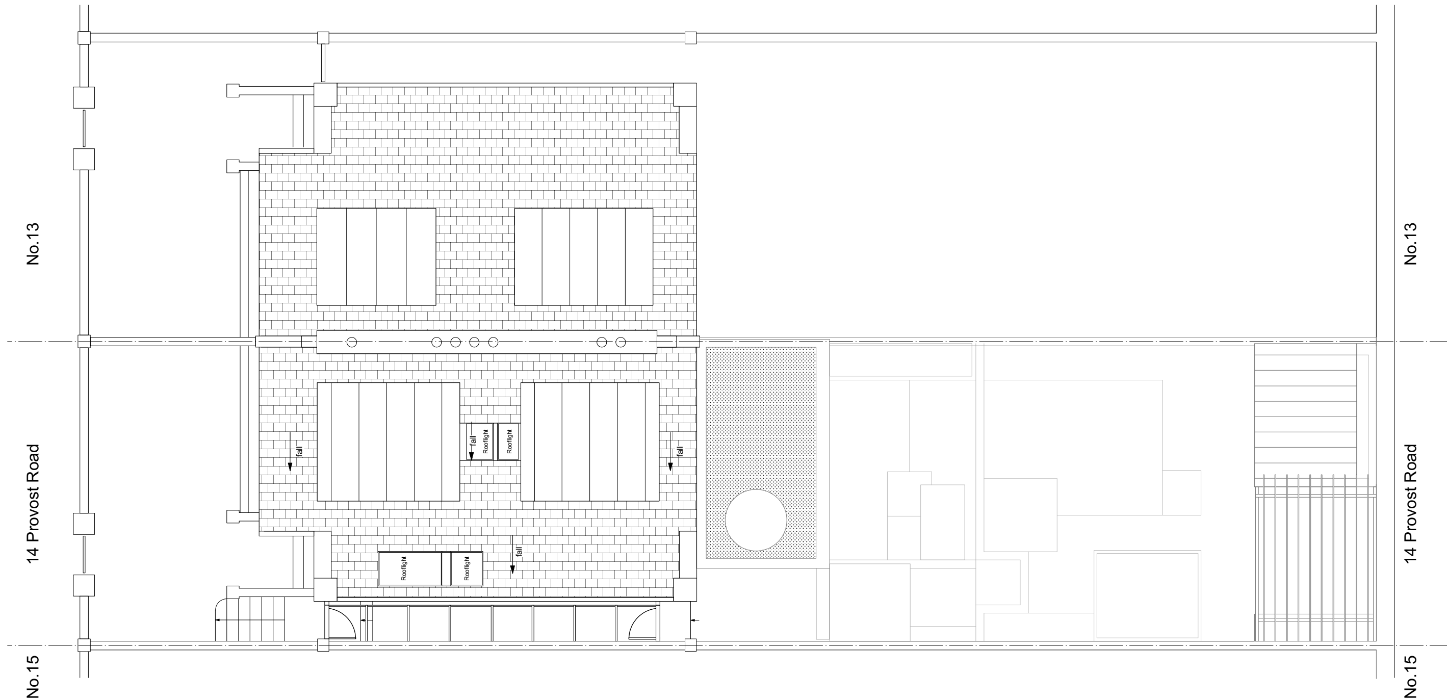
Roof Plan PLAN