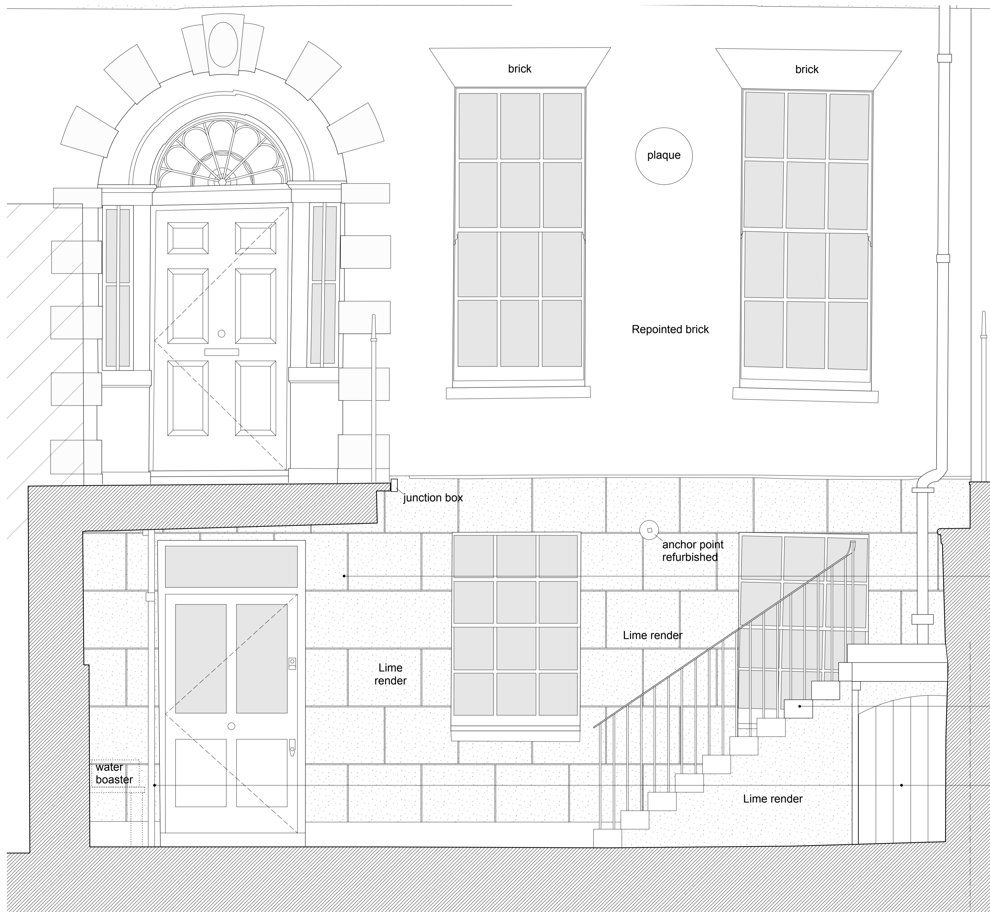
41 BEDFORD SQUARE