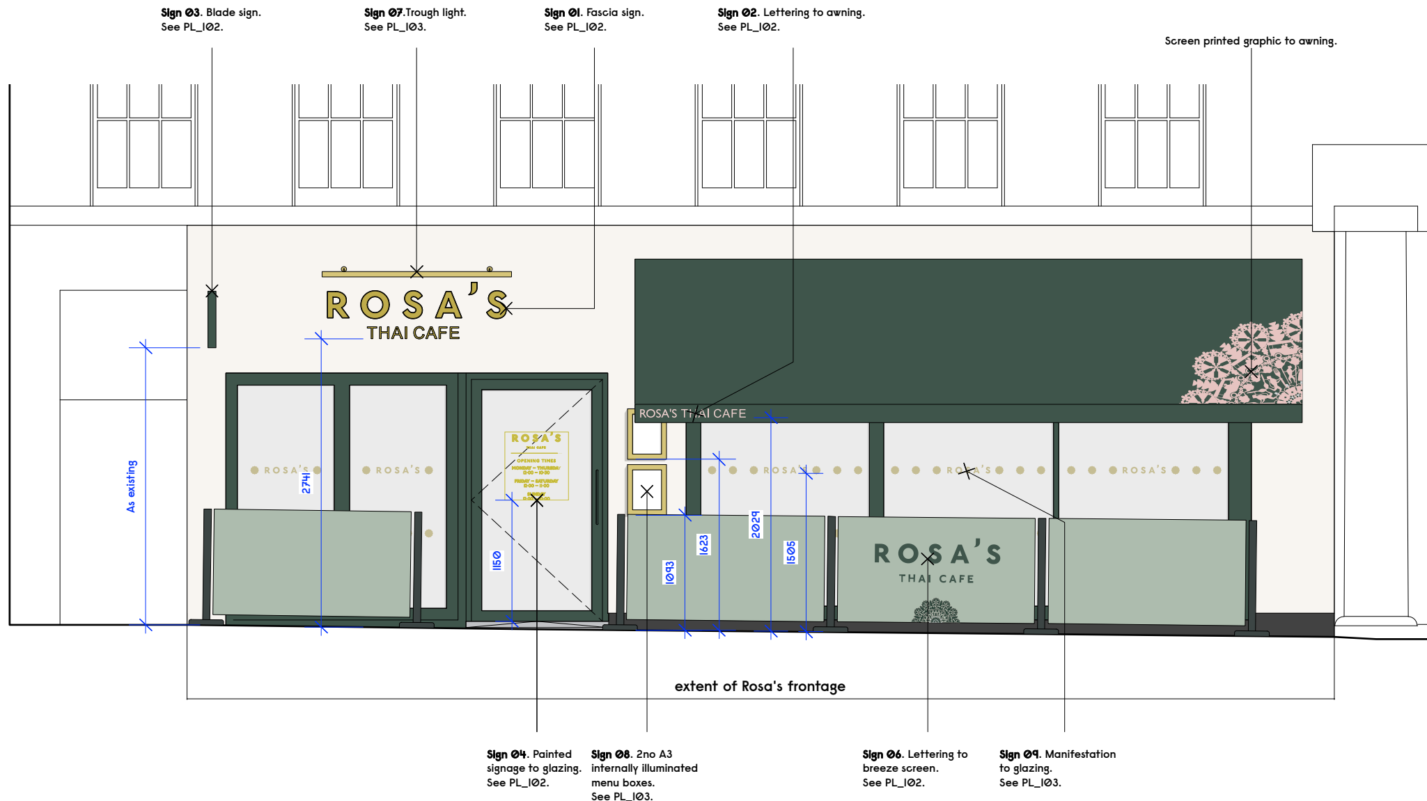
1 Proposed Shopfront Elevation Scale: 1:50