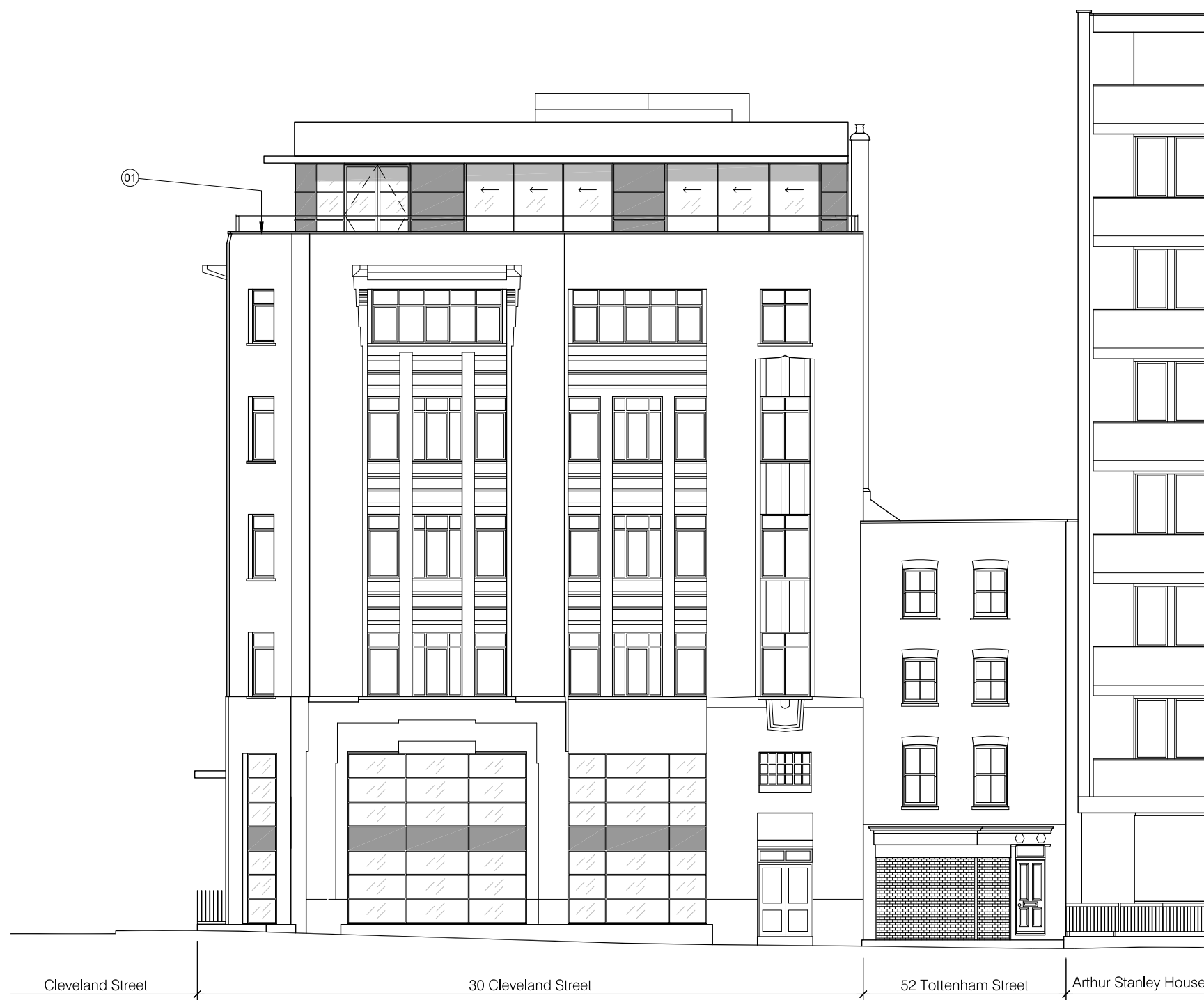
01 Proposed Tottenham Street Elevation 20.202 Scale 1:150 @ A3