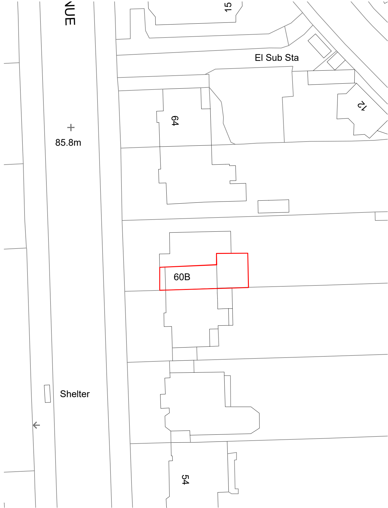
EXISTING BLOCK PLAN 1.500