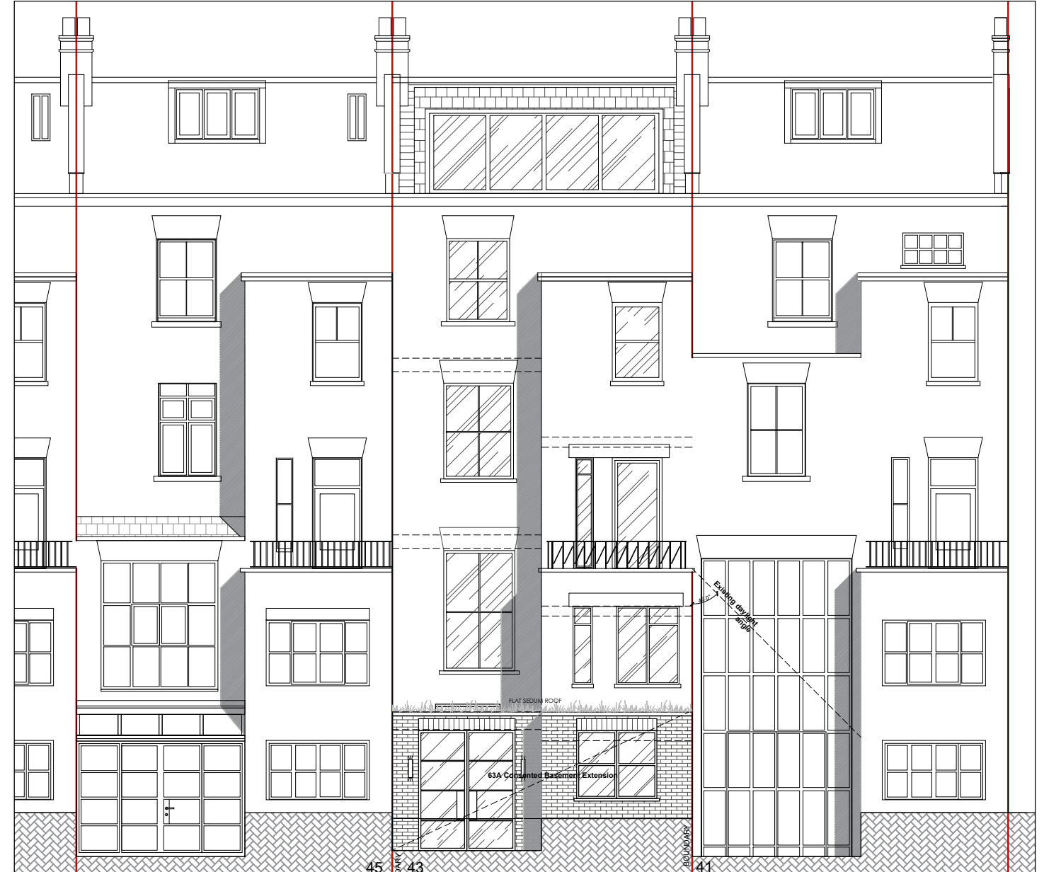
Existing Context Elevations including no.43A basement consented scheme