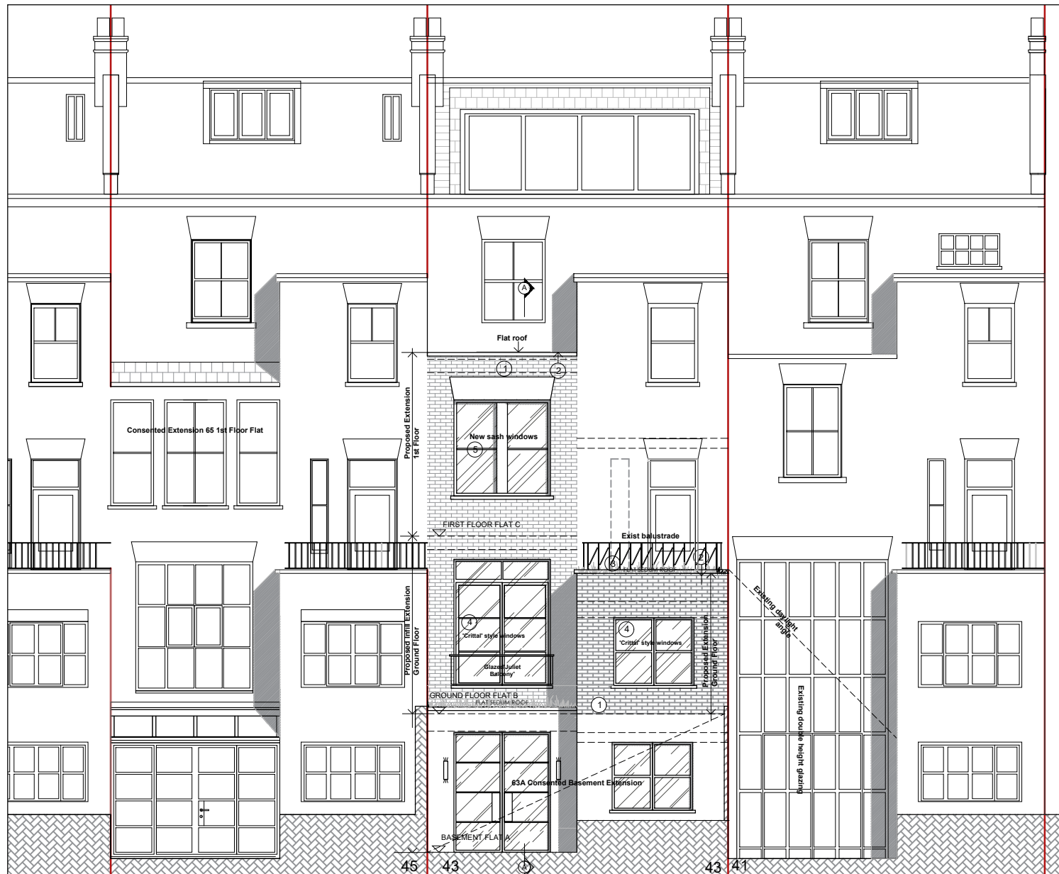
Proposed Context Elevations including no.45 consented scheme