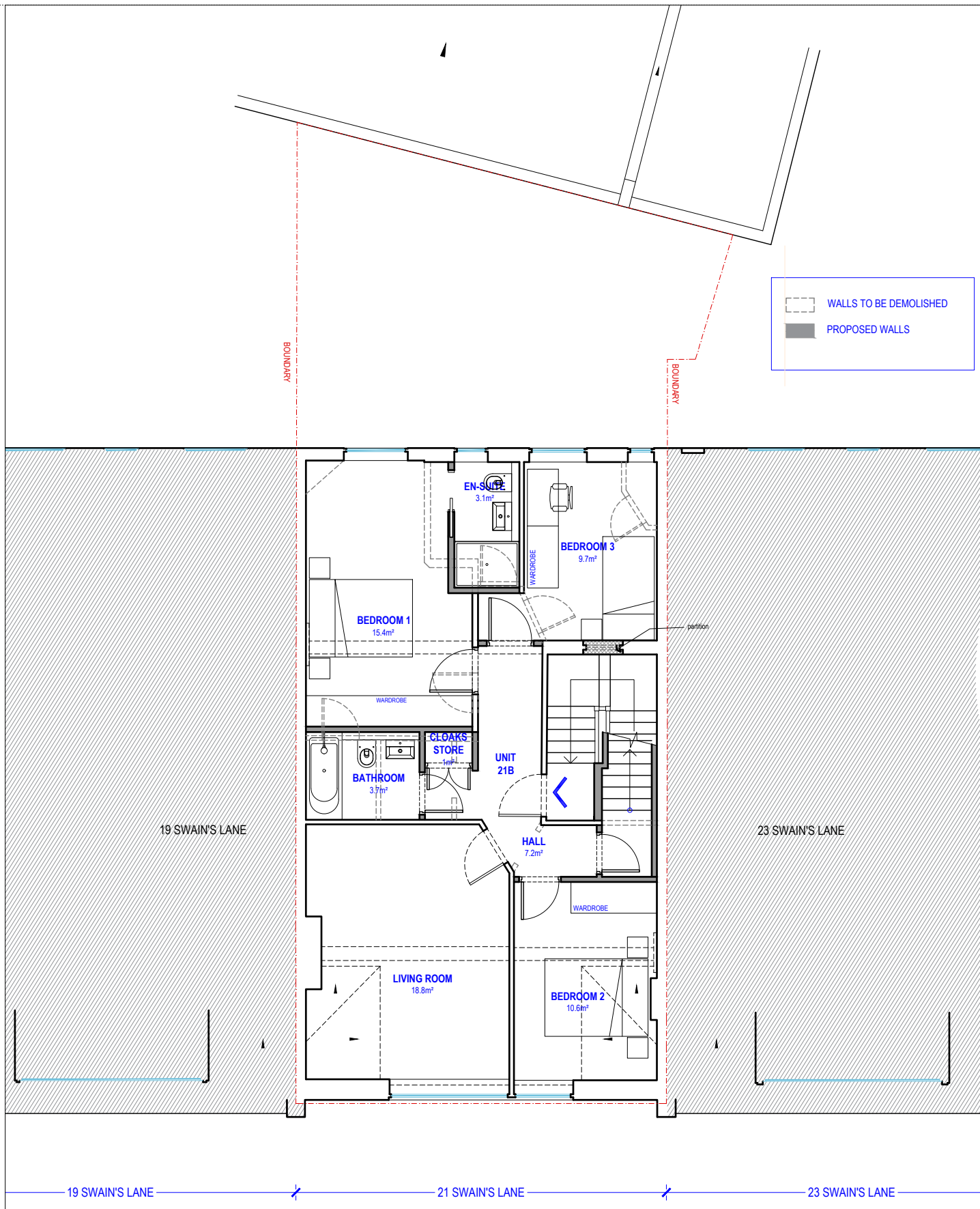
[01] PROPOSED SECOND FLOOR PLAN