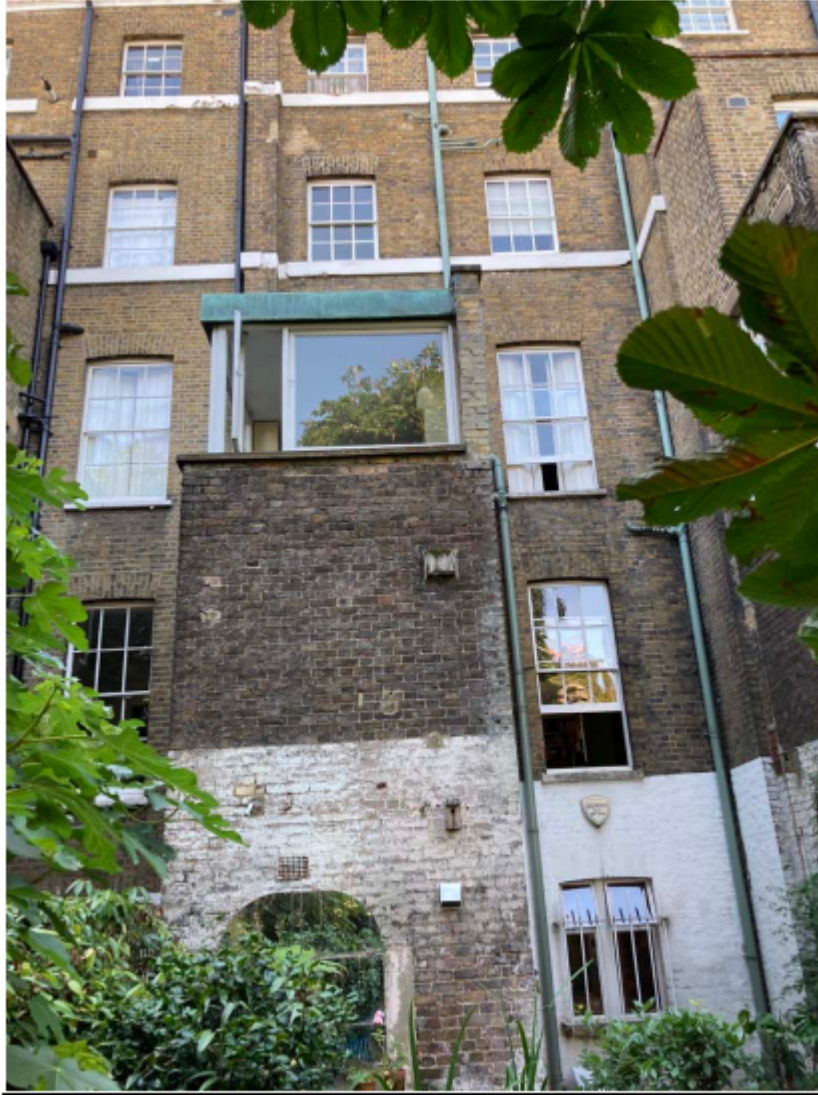
2. Rear elevation