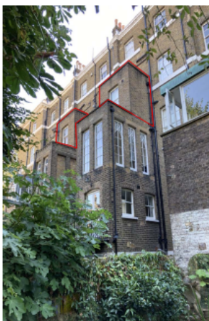
Number 3 and 4 Regents Park Terrace both have the additional set back second floor extension