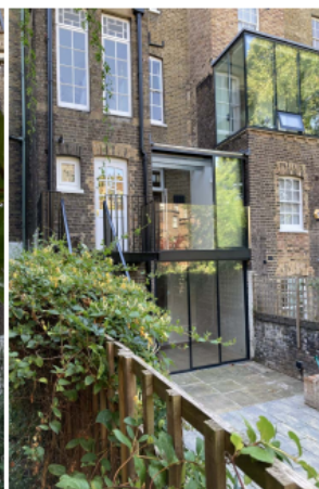
Number 6 Regents Park Terrace lightweight double height infill extension