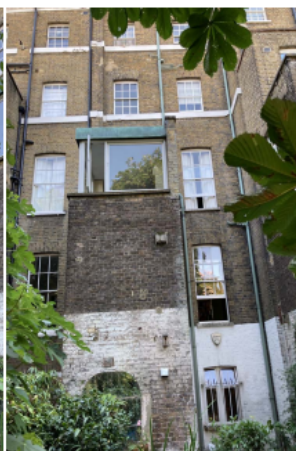
Number 5 Regents Park Terrace Existing Rear Elevation