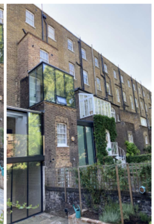
Looking East up the terrace a number of other properties have also done double height infill extension with the set back 2nd floor outrigger