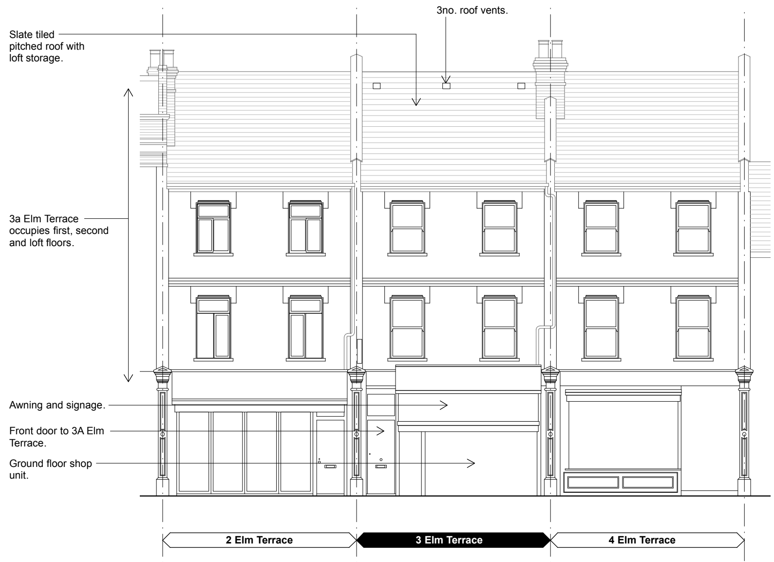
(PL)09_Front Elevation - Existing

NOTES: © t A Greig Limited- All rights described in Chapter IV of the Copyright, Designs and Patents Act 1988 have been asserted.