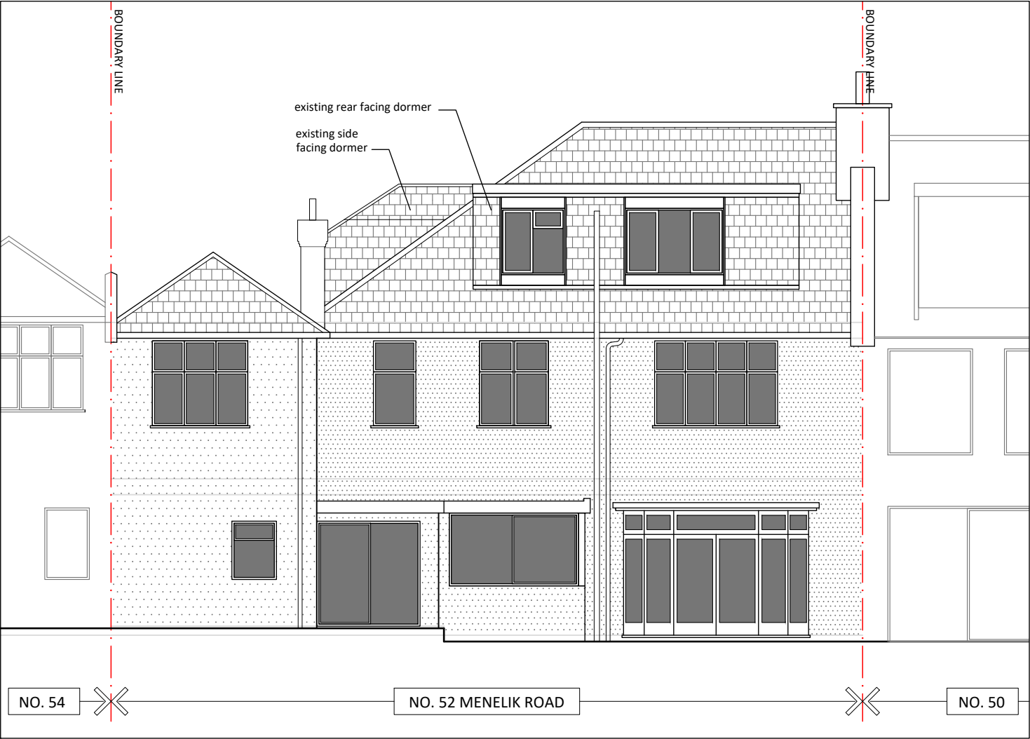
EXISTING REAR ELEVATION (NORTH EAST) SCALE 1:100 @ A3