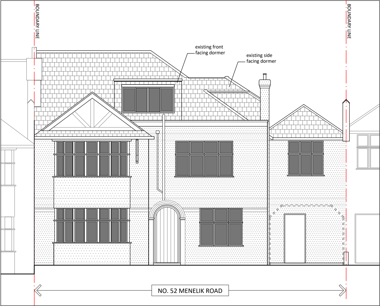
EXISTING FRONT ELEVATION (SOUTH WEST) SCALE 1:100 @ A3