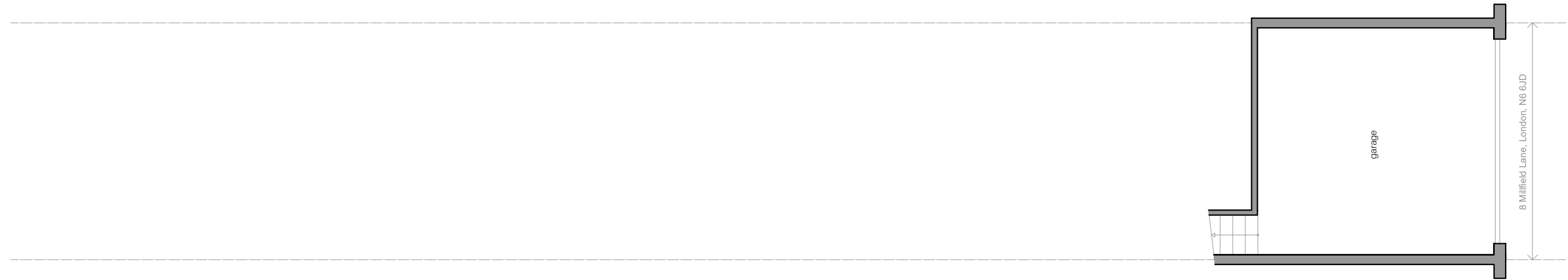
GARAGE E: 1/100