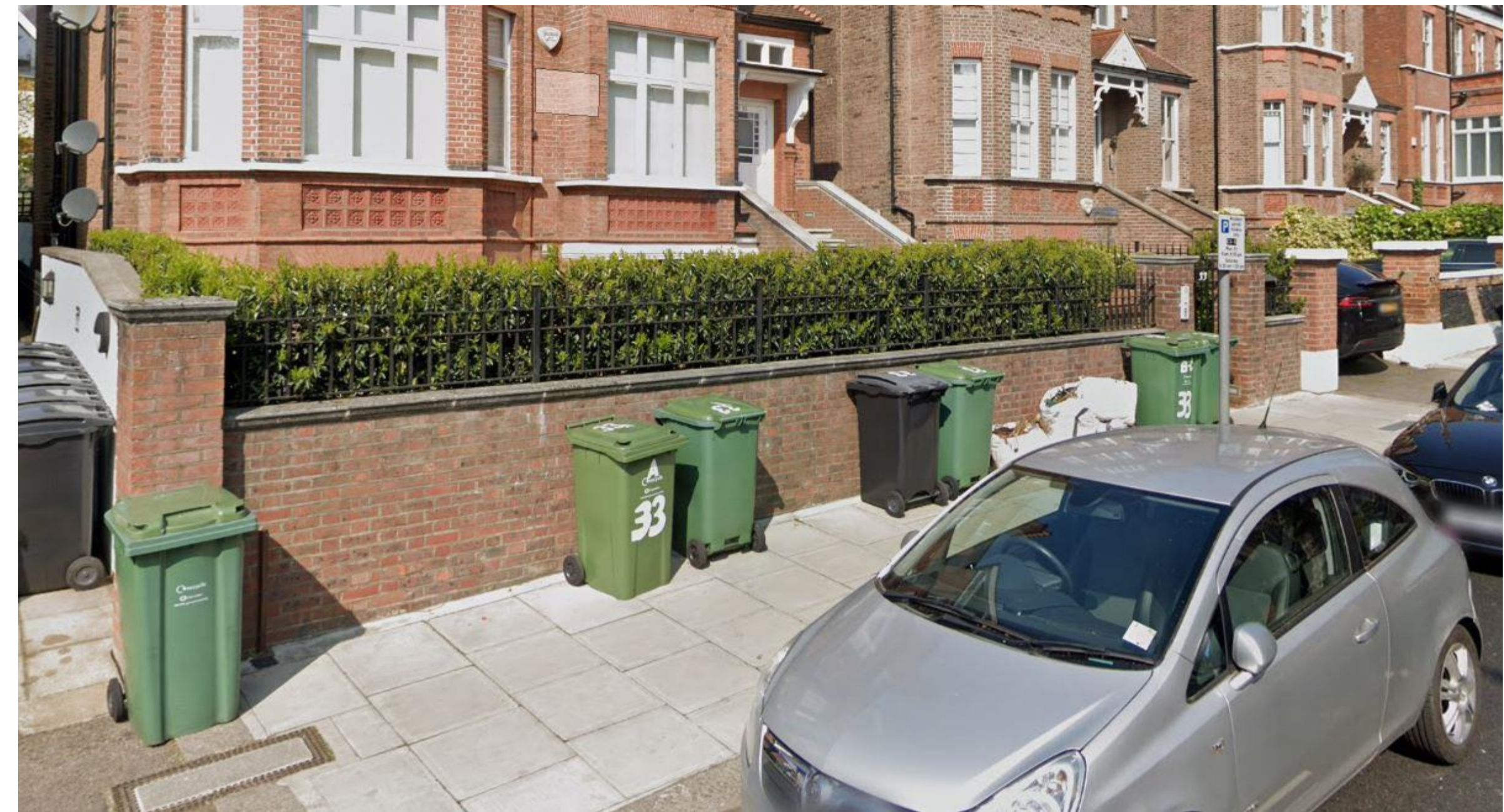
3 EXAMPLE - 33 MARESFIELD GARDENS