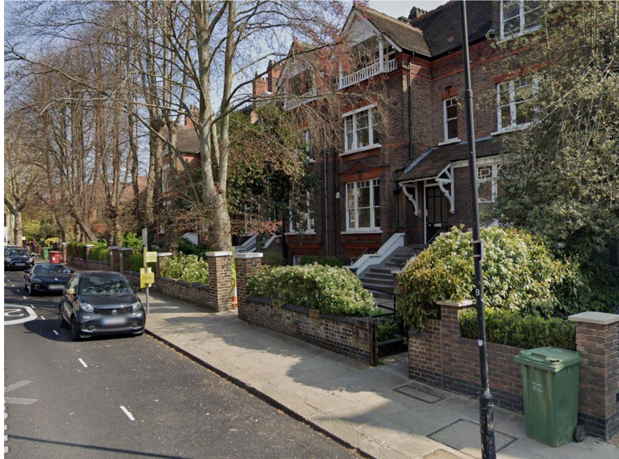
2 EXISTING PHOTO - 12 MARESFIELD GARDENS