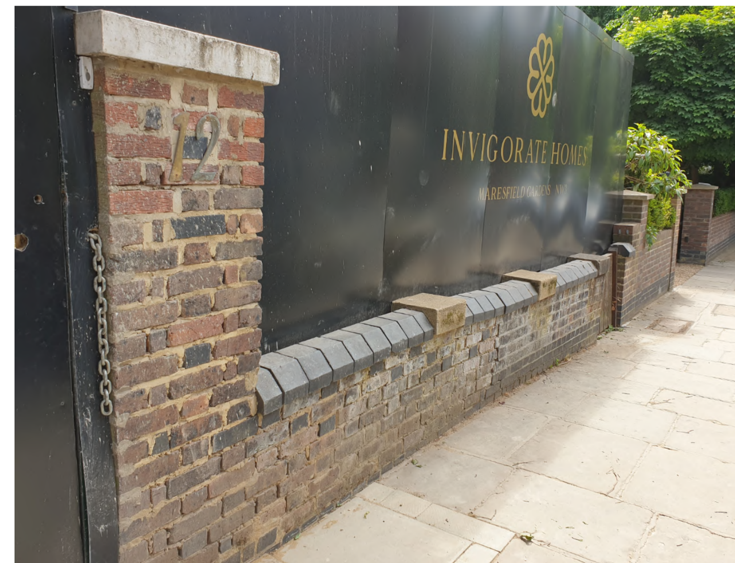
5 CONDITION OF FRONT WALL - 12 & 14 MARESFIELD GARDENS