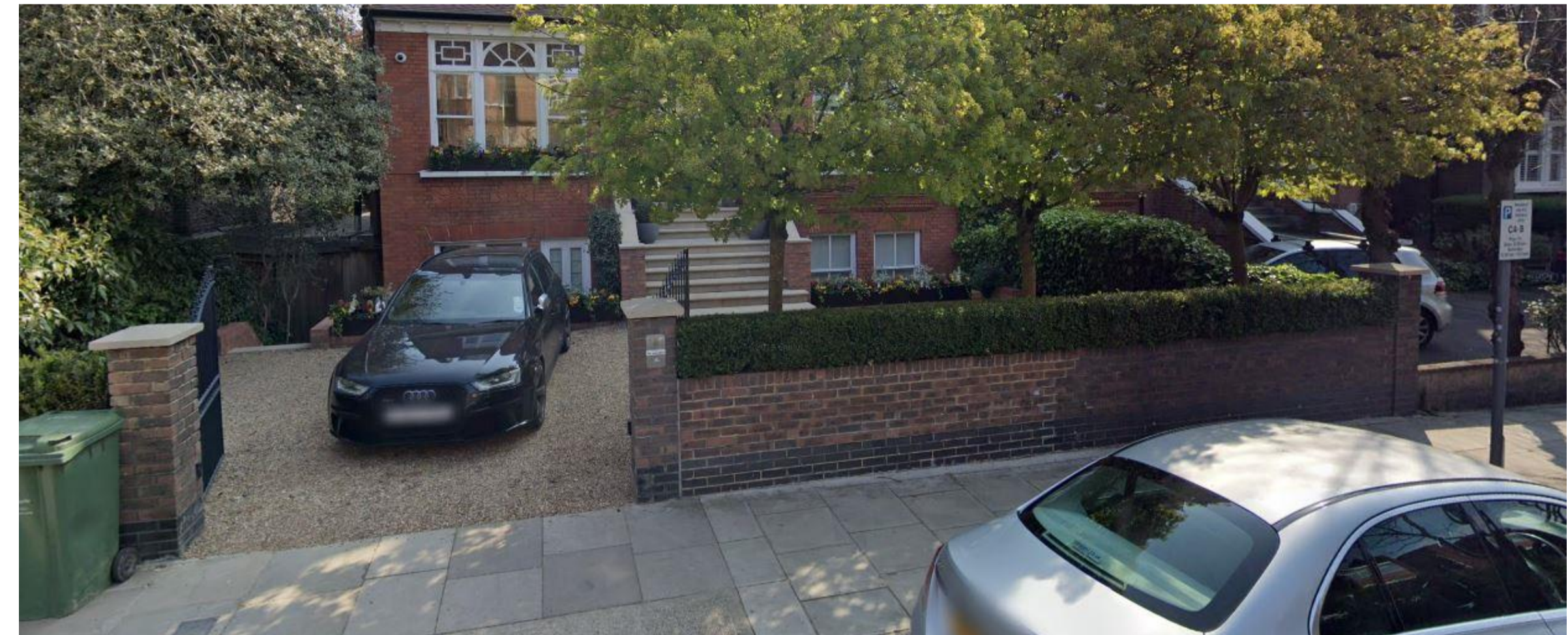
4 EXAMPLE - 10 MARESFIELD GARDENS