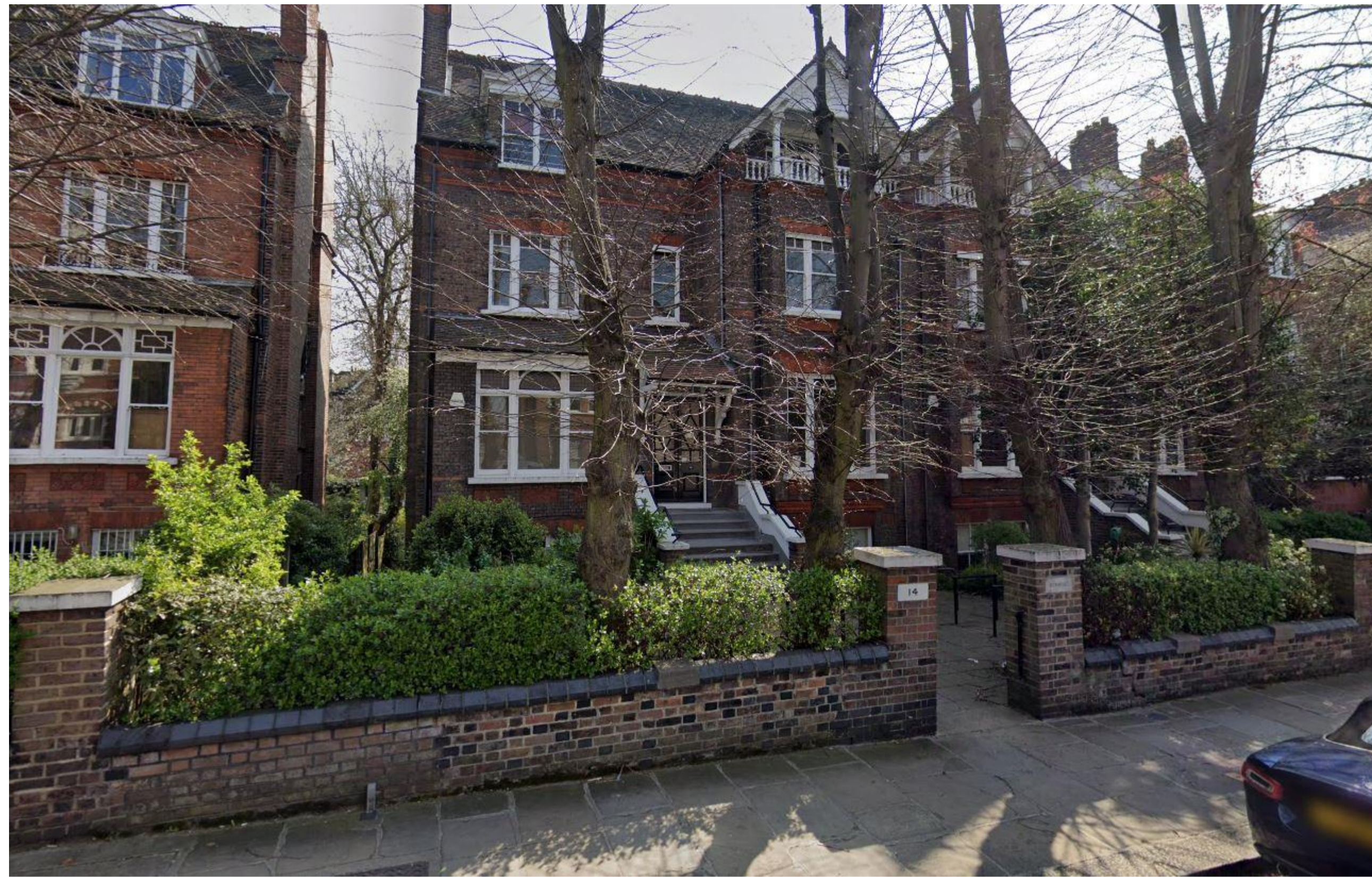
1 EXISTING PHOTO - 14 MARESFIELD GARDENS