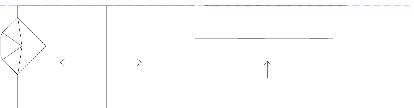
Roof Plan As Existing