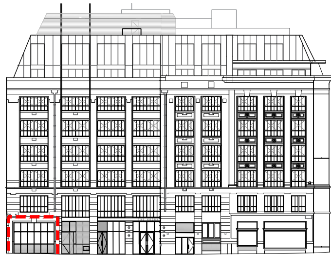
Reference Elevation - Keeley Street