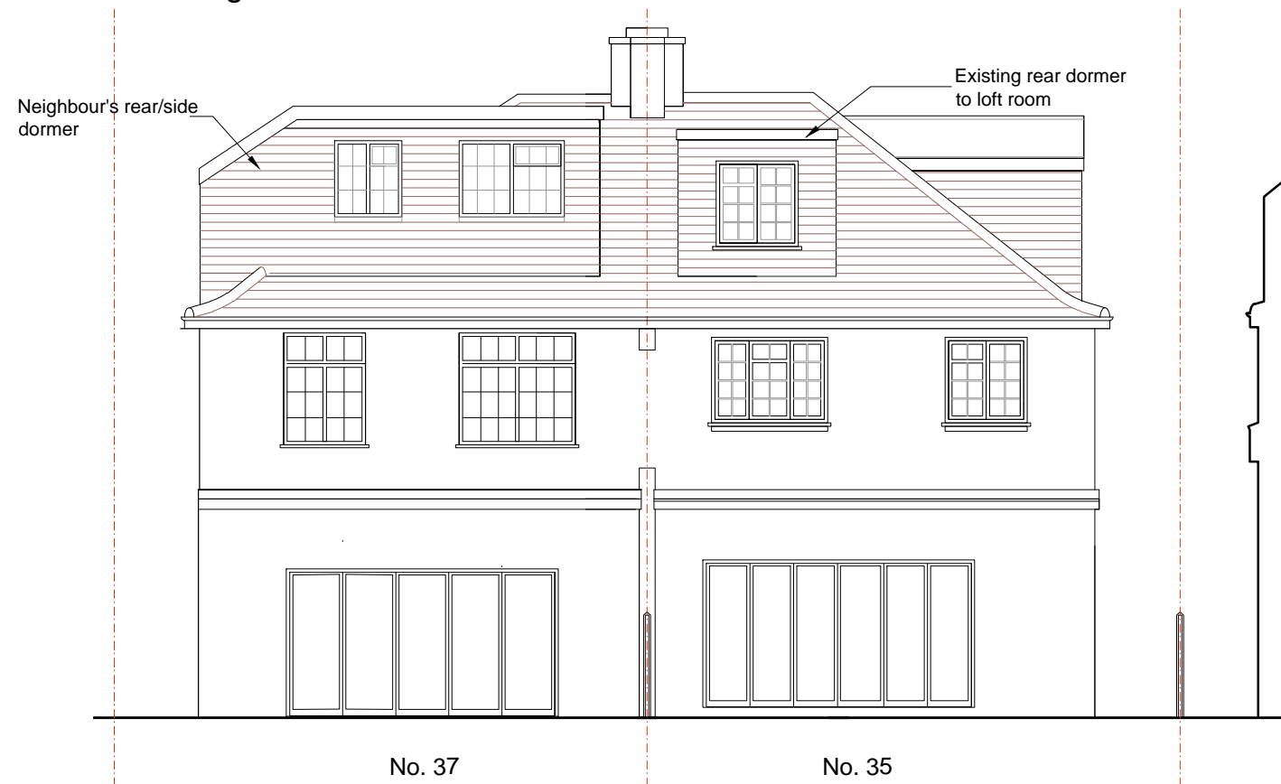
C. Existing Rear Elevation