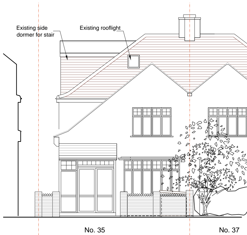
A. Existing Elevation from Street