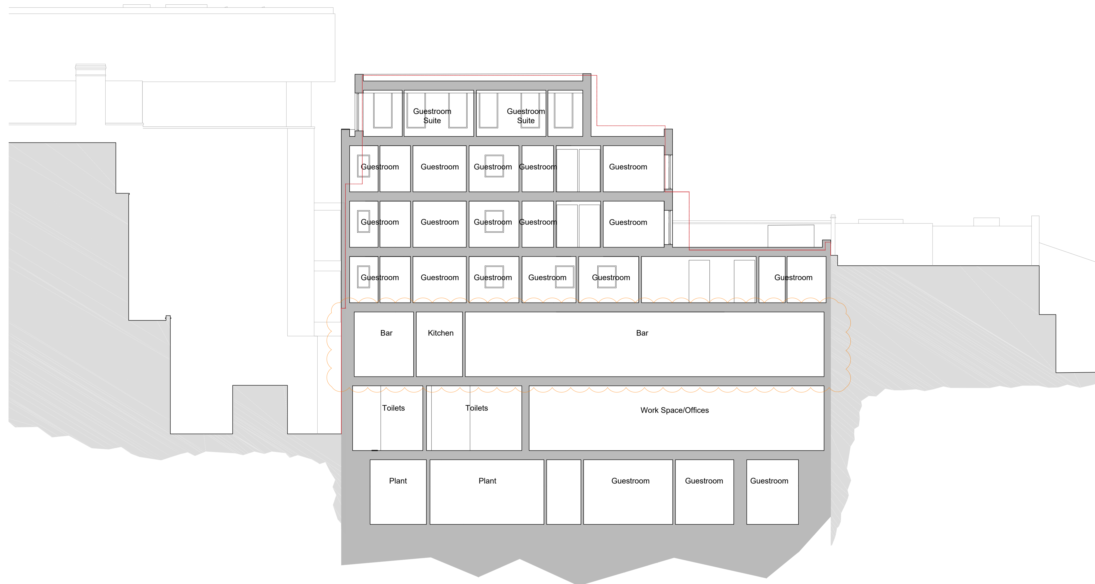
Section DD 1:100