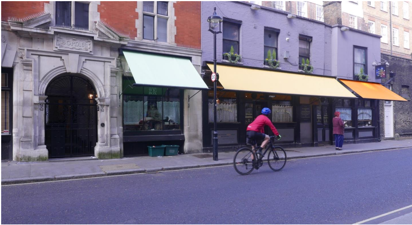
ACROSS CAREY STREET VIEW OF AWNINGS EXTENDED, WITH LIGHTS AND HEATERS