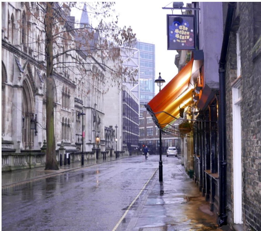
PAVEMENT VIEW OF AWNINGS IN EXTENDED POSITION, WITH LIGHTS AND HEATERS. ROYAL COURTS OF JUSTICE OPPOSITE