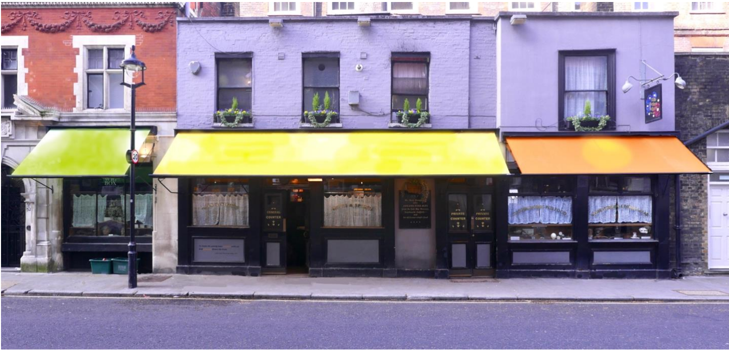
THREE AWNINGS IN EXTENDED POSITION