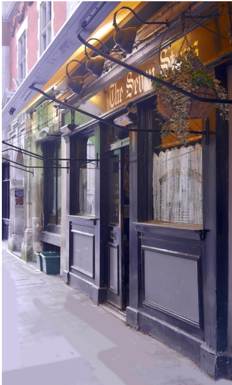
PUB FRONTAGE WITH AWNING ARMS EXTENDED