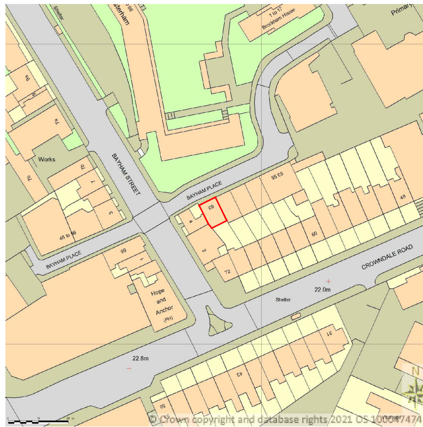
LOCATION PLAN Sc. 1/1250