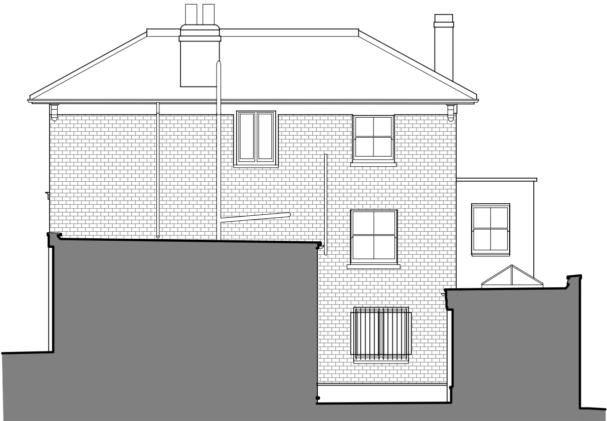
X PROPOSED Rear Elevation 1:100@A3