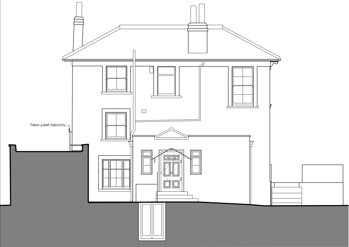
X PROPOSED Front Elevation 1:100@A3