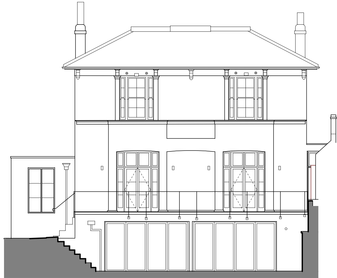
X PROPOSED Side 2 Elevation 1:100@A3