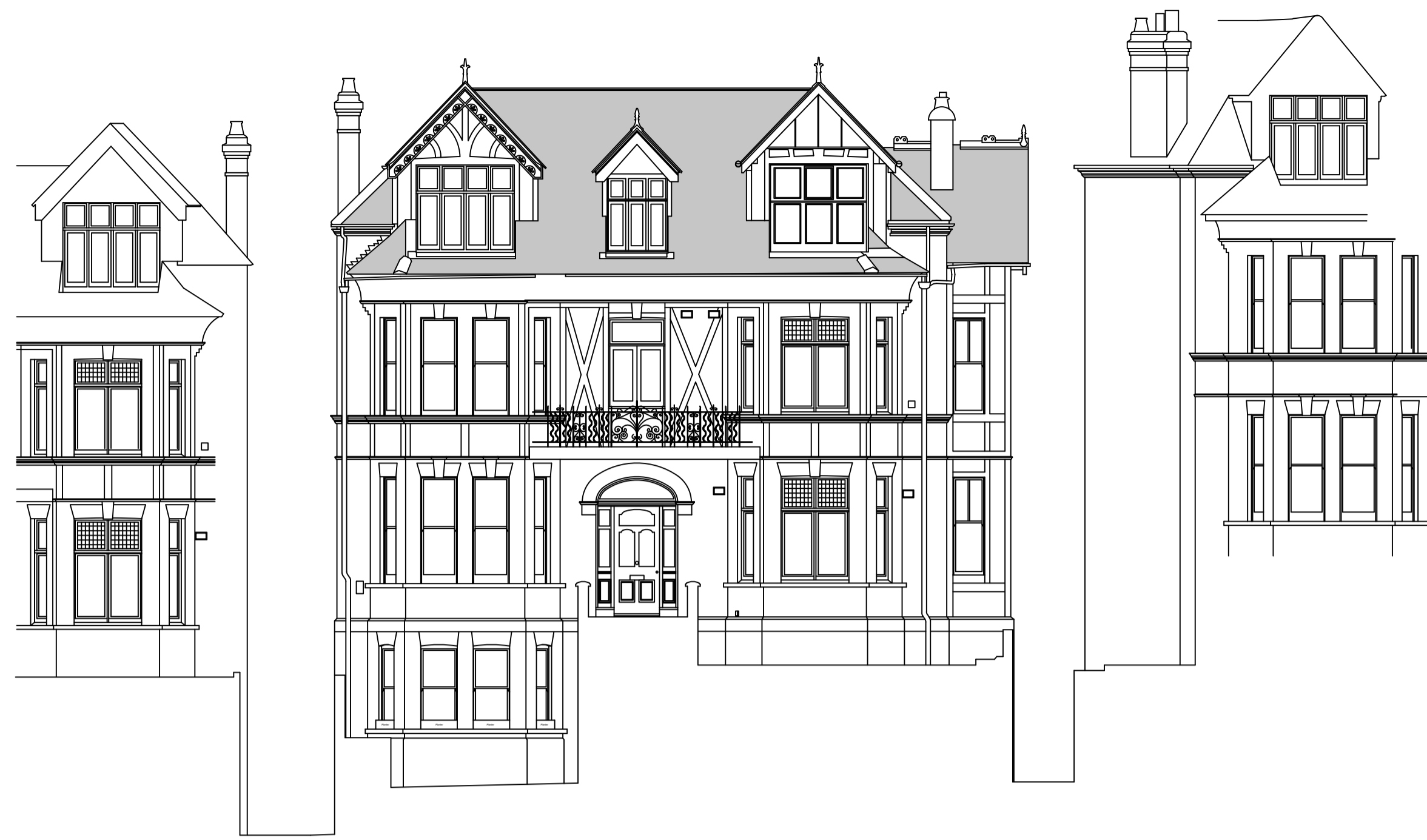
DATUM: 90.00m Front Elevation (facing northeast)