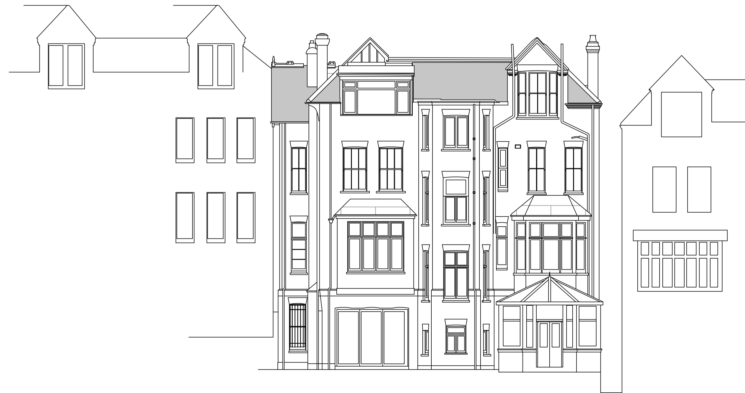
DATUM: 90.00m Rear Elevation (facing southwest)